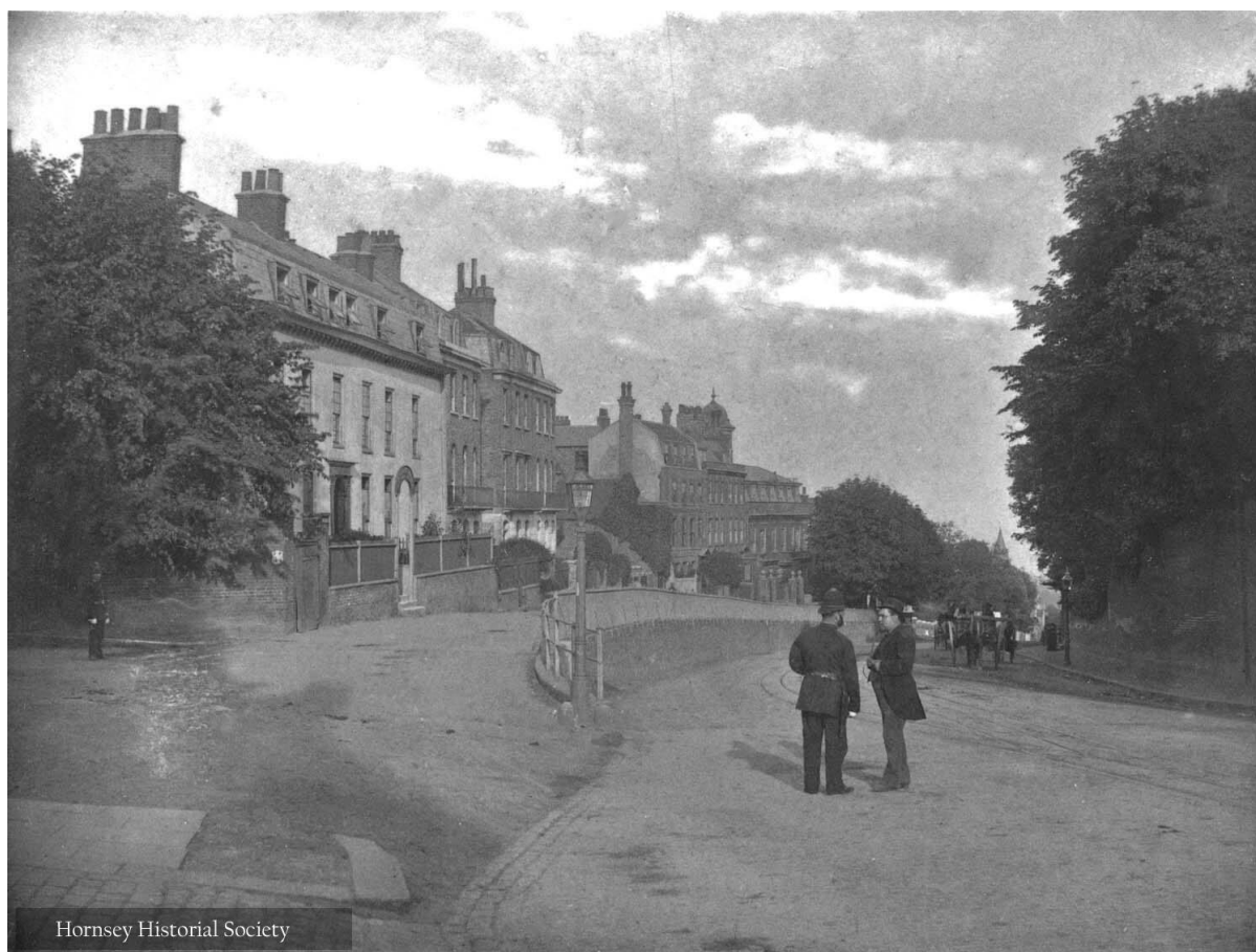
Highgate Hill c 1900