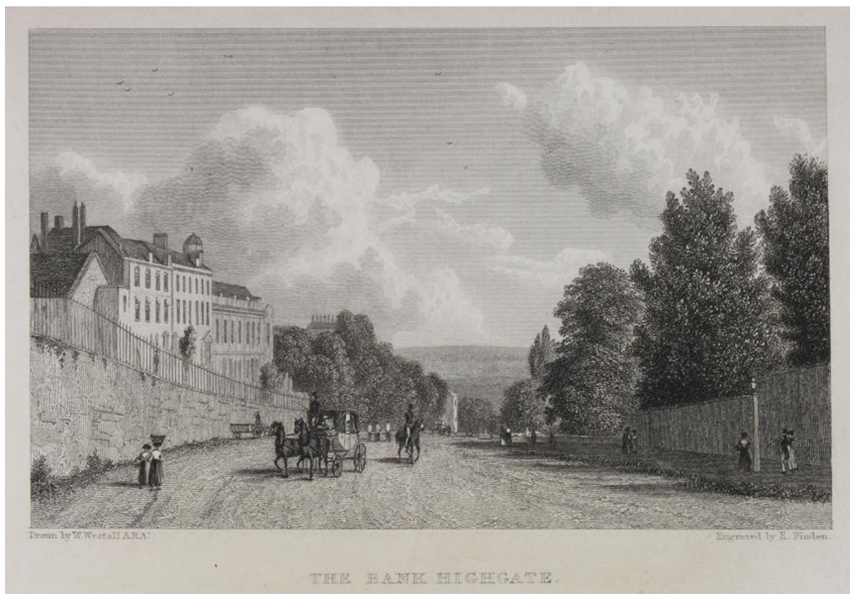
Highgate Hill c 1820-30