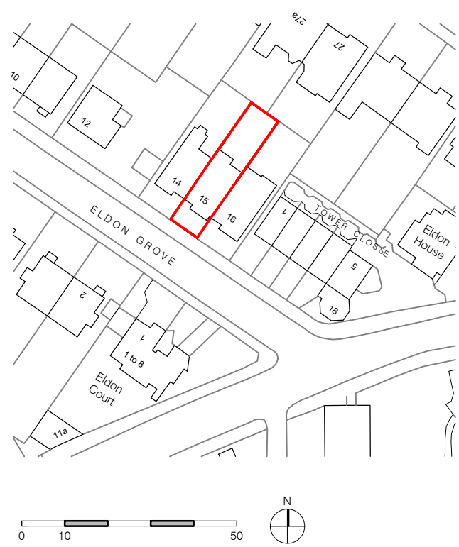
SITE LOCATION PLAN SCALE 1:1250 @ A3