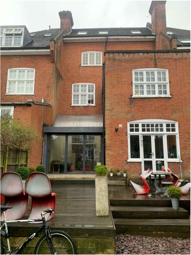
15 ELDON GROVE REAR ELEVATION