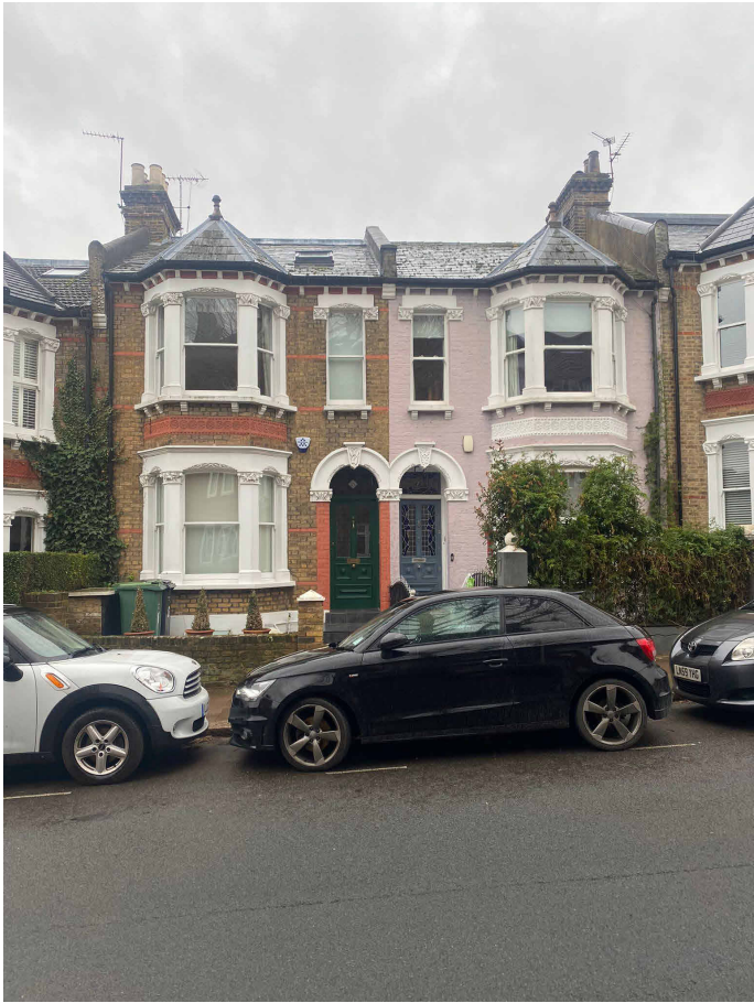
02 | Front Elevation