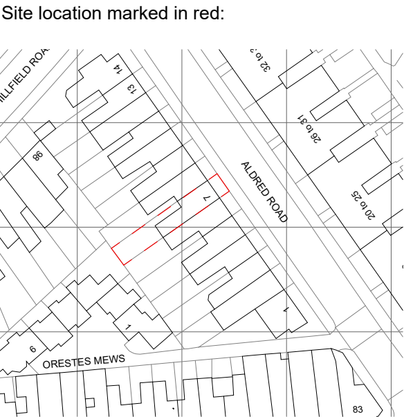
03 | Site location plan 1 : 1250