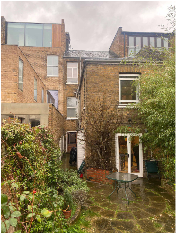
05 | Rear Elevation

Unless indicated in status, this drawing is for information only. The Contractor to advise on all details and ensure stability and strength of construction. The Contractor to provide setting out drawings for approval prior to construction. The Contractor to check all dimensions on site and relate to these drawings. The Contractor to report any discrepancies to Designers prior to construction. All services to Local Authorities, BCO and Environmental Health regulations and to Service Engineers details. All structure to Structural Engineers details and Local Authority and BCO regulations. All construction and materials to comply with current Building and Fire Regulations. Drawings should be removed from circulation immediately a revised version is issued. No dimensions to be scaled from this drawing - use figured dimensions only. All dimensions to be checked on site, any discrepancies found between this drawing and other documents should be referred immediately to the consultants. All dimensions in mm. This drawing is Copyright © ITO Lab Ltd.