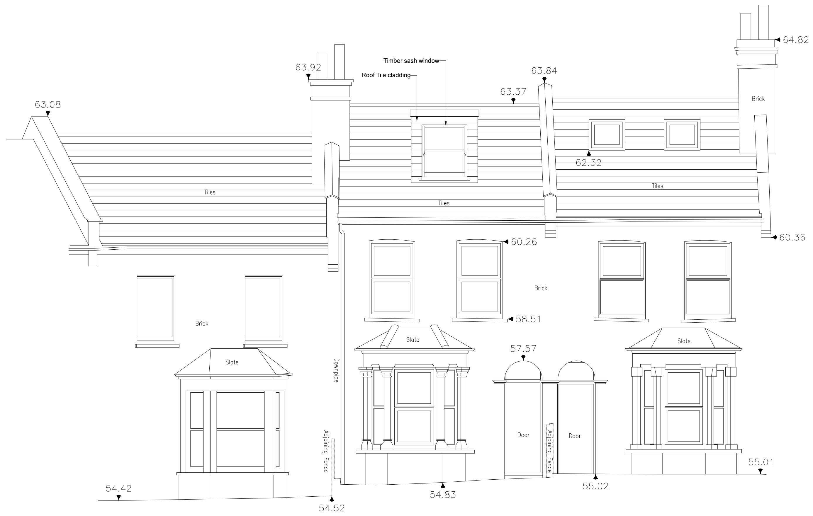
E PROPOSED FRONT ELEVATION SCALE: 1:50 @ A1