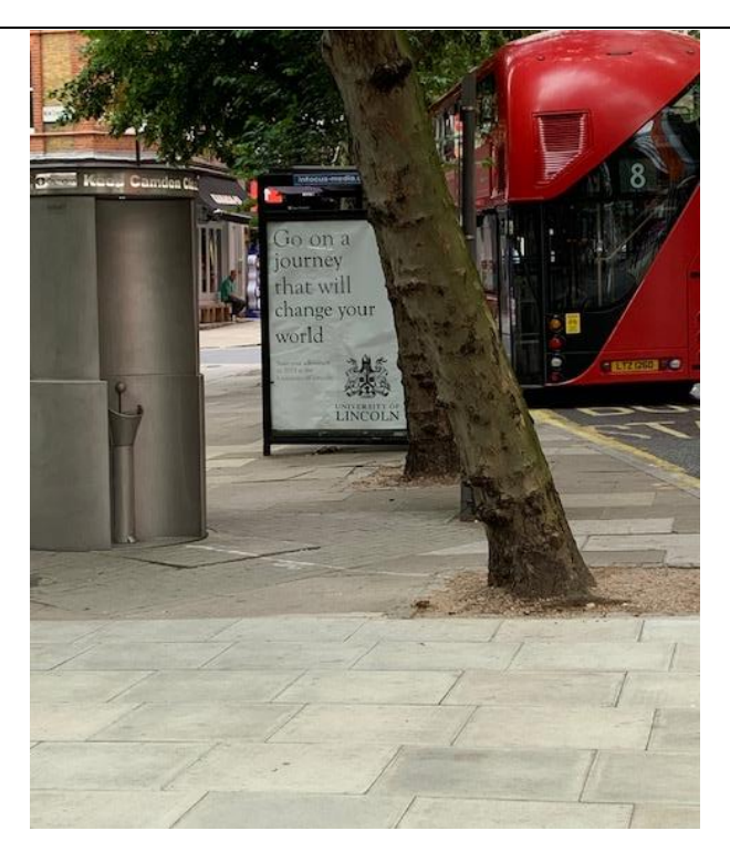
Current public footway cluttered with street furniture

4.2 It is acknowledged that the proposal would include a defibrillator, free Wi-Fi & phone calls to emergency services and charities, defibrillator, wayfinding, device charging, public messaging capabilities, CCTV. There is no evidence before the Council that these benefits can only be achieved on a kiosk of the proposed scale with the inclusion of a large digital panel. Furthermore, as a result of Covid, many facilities such as wayfinding have been switched off and are unlikely to be used in the same way. We have no evidence of how well these types of facilities are appropriately used, especially most exist on personal mobile phones. We have no details on the locations of existing wayfinding or defibrillator coverage in the area. There is scope of public messaging capabilities on existing bus shelters within the street. Furthermore a number of these benefits, such as phone charging, is something that can encourage ASB and can be given limited weight. Whilst weight is given to some of the benefits, for the reasons they do not outweigh the harm caused to the character and appearance of the streetscene, public safety and the loss of footway and the impact on the public realm is not justified.