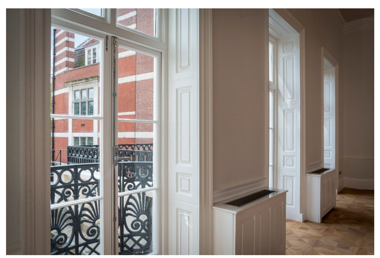
Example of wall-mounted fan-coil units concealed with timber-panelled casings