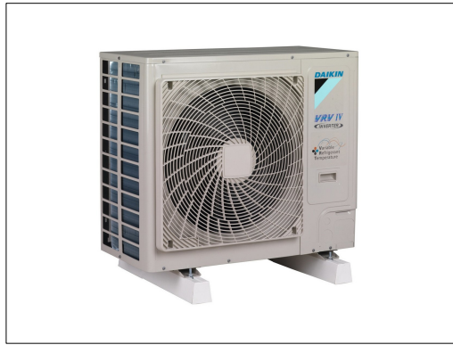
Proposed external heat pump (823mm high x 940mm wide x 460mm deep)