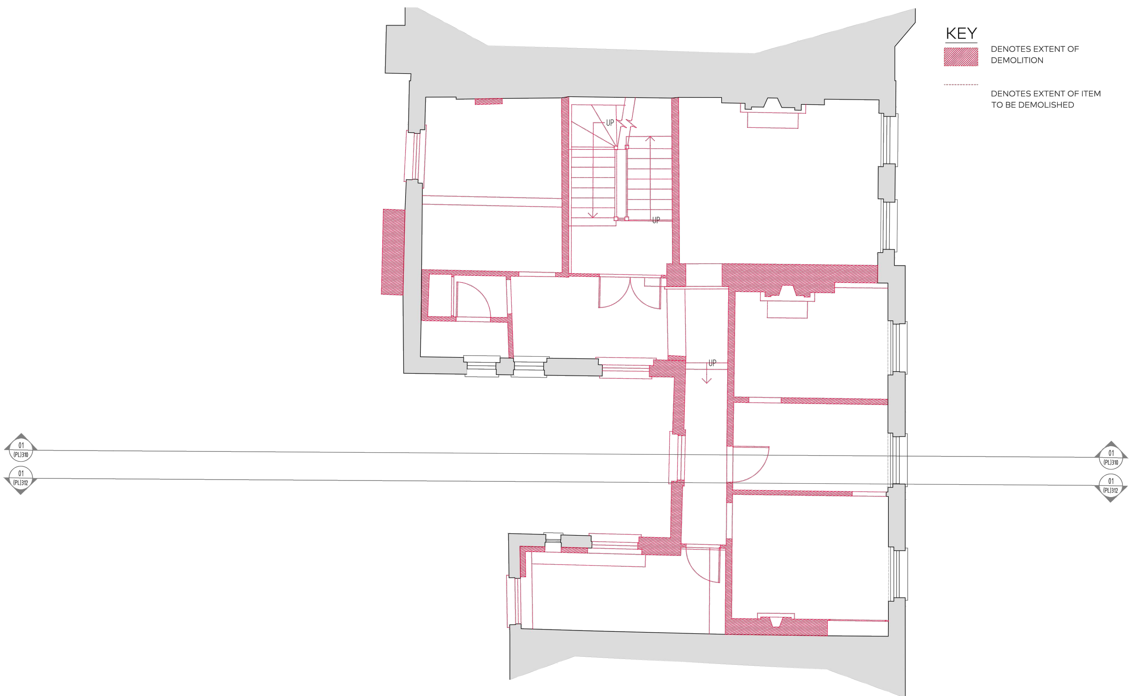
First Floor Plan, as existing with demolitions, UNCHANGED FROM PREVIOUSLY APPROVED REF: 2017/4551/P Scale 1:50