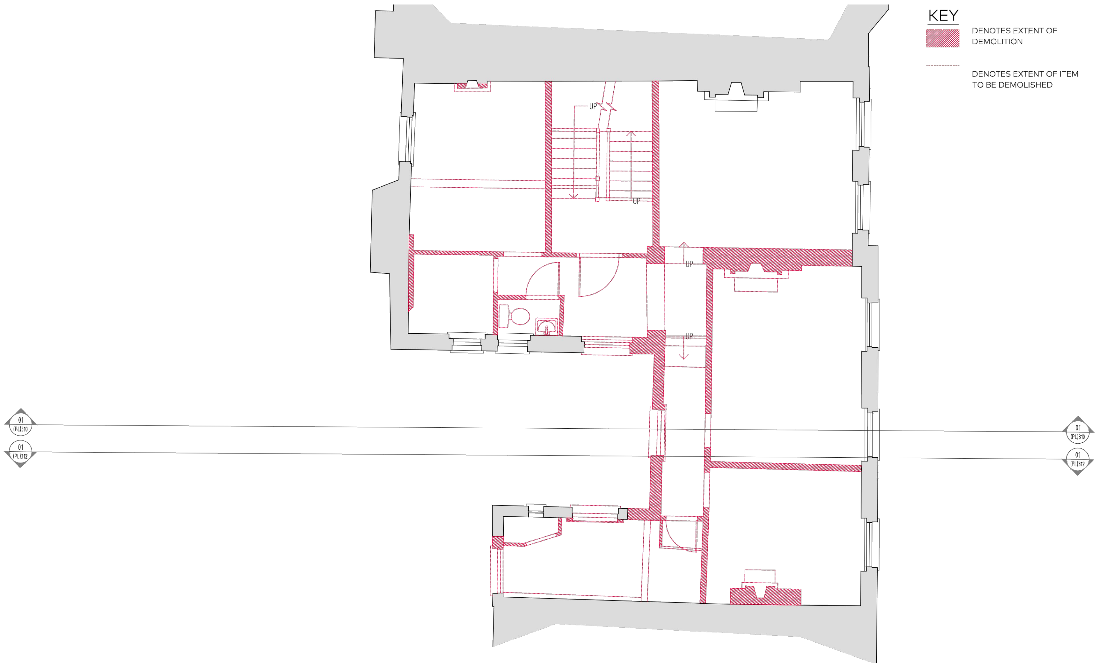
Second Floor Plan, as existing with demolitions, UNCHANGED FROM PREVIOUSLY APPROVED REF: 2017/4551/P Scale 1:50