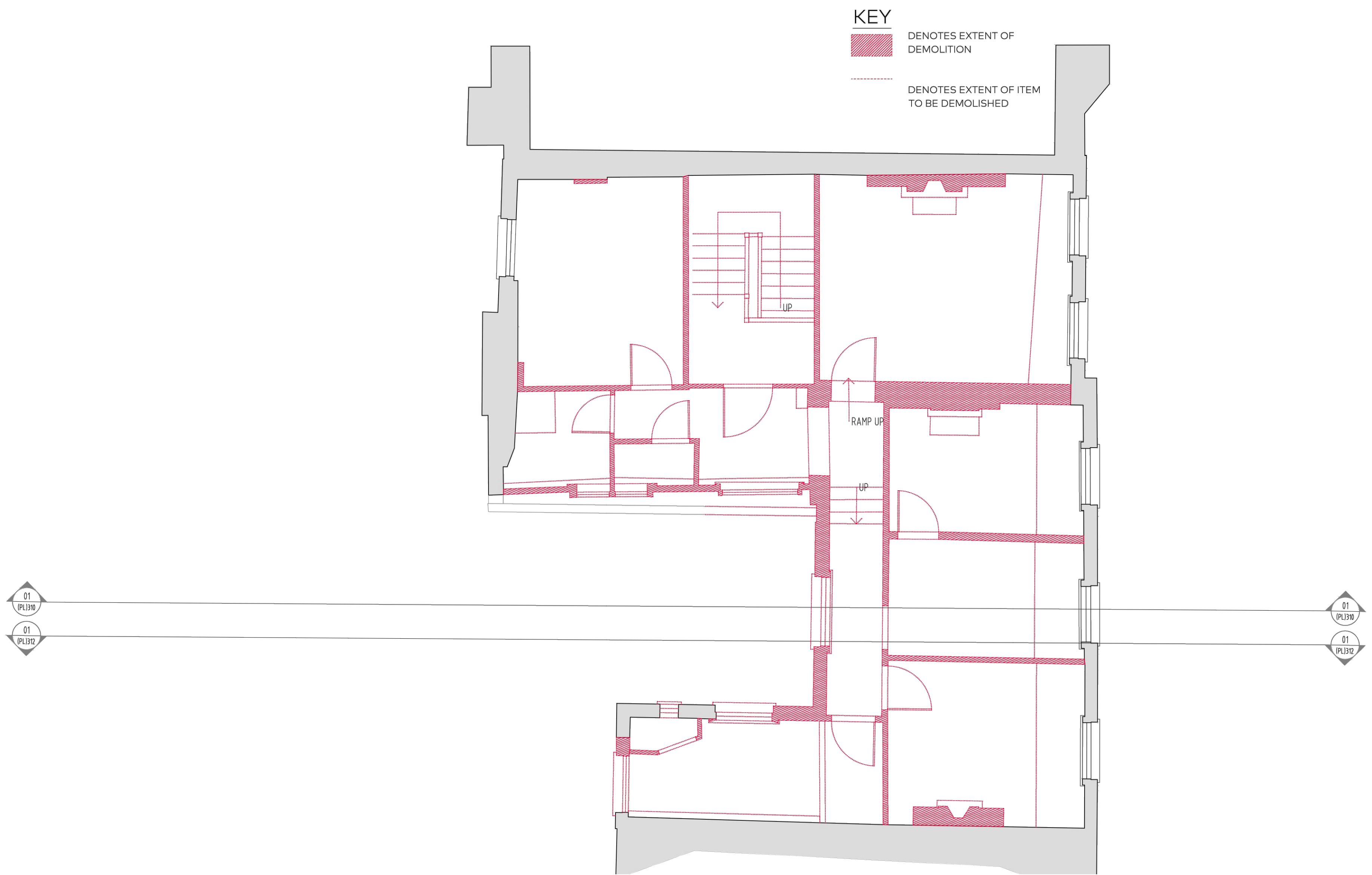
Third Floor Plan, as existing with demolitions, UNCHANGED FROM PREVIOUSLY APPROVED REF: 2017/4551/P Scale 1:50