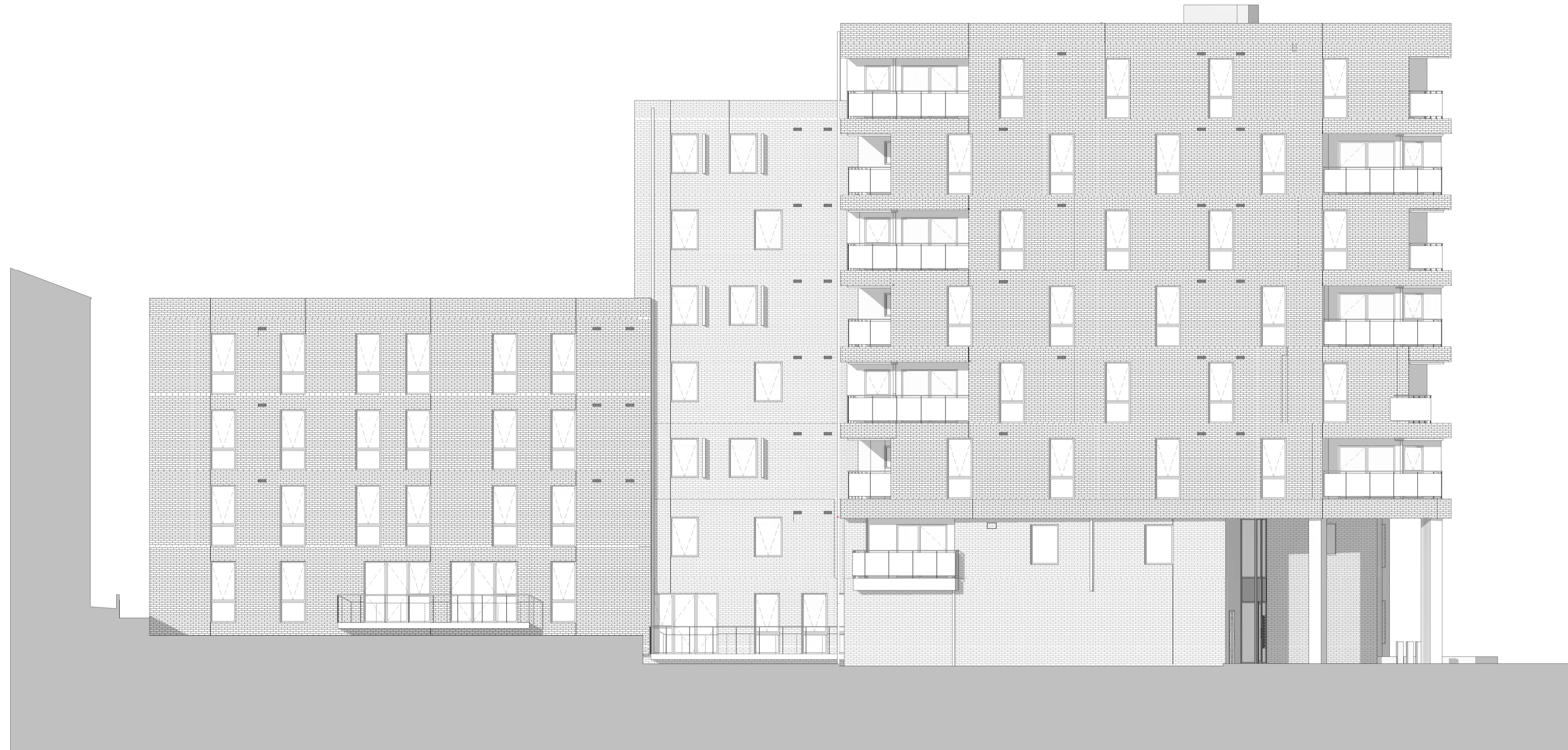
1 202 Elevation North - Existing 1:100