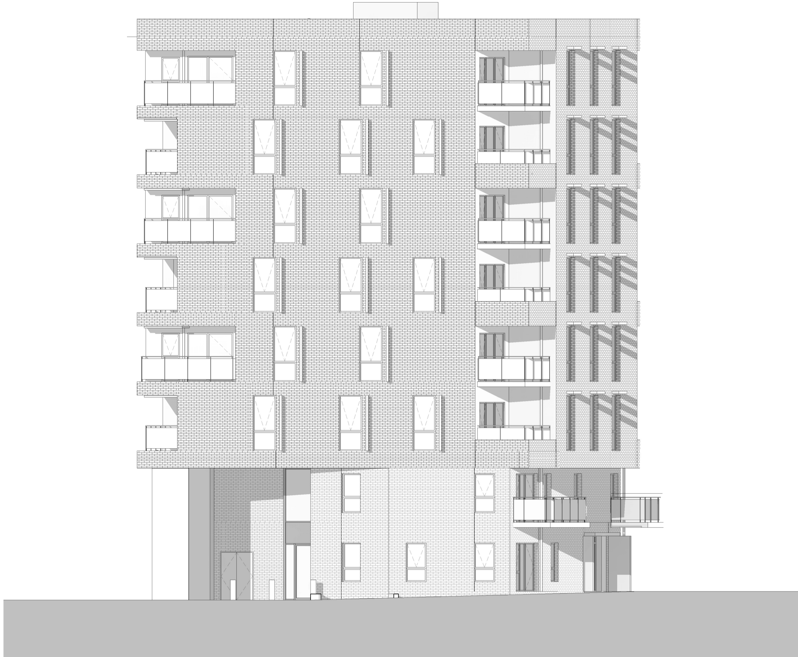
1 201 Elevation West - Existing 1 : 100