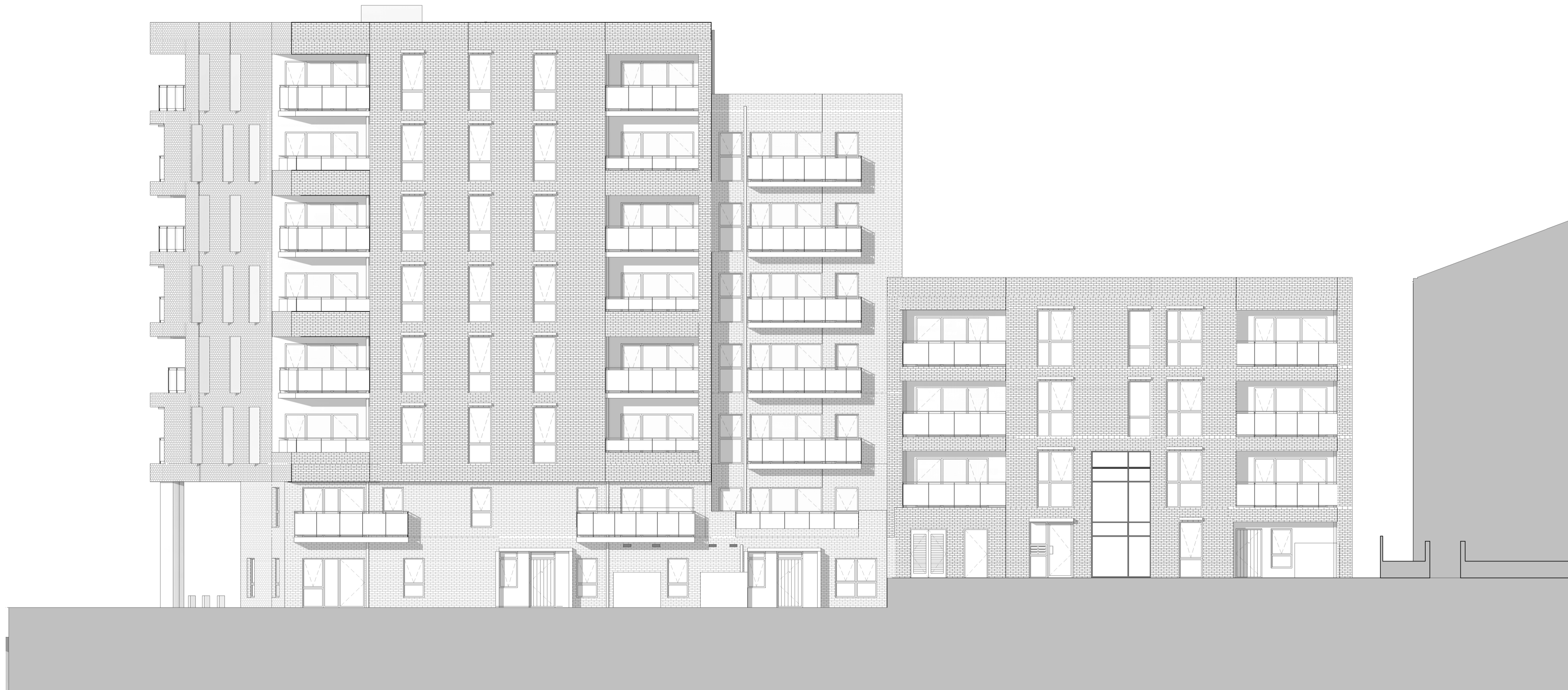
1/200 Elevation South - Existing 1:100