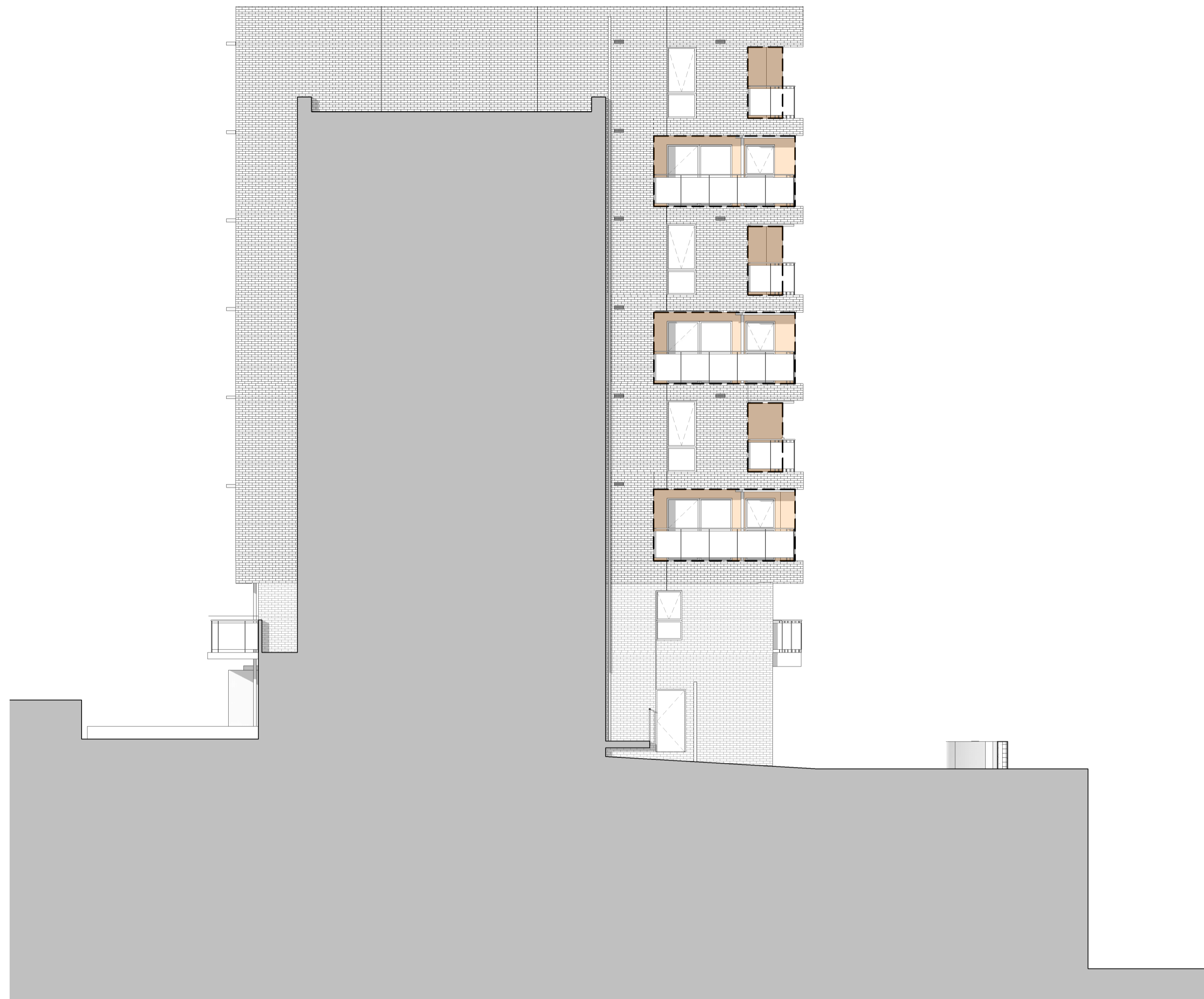
1 178 Elevation East - Proposed 1:100