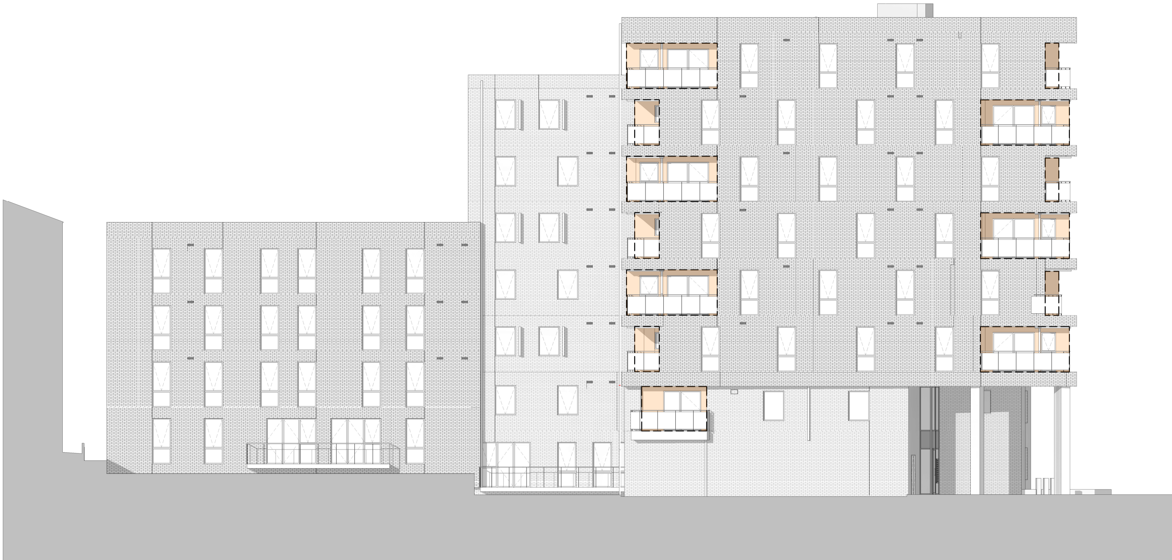
1 177 Elevation North - Proposed 1 : 100