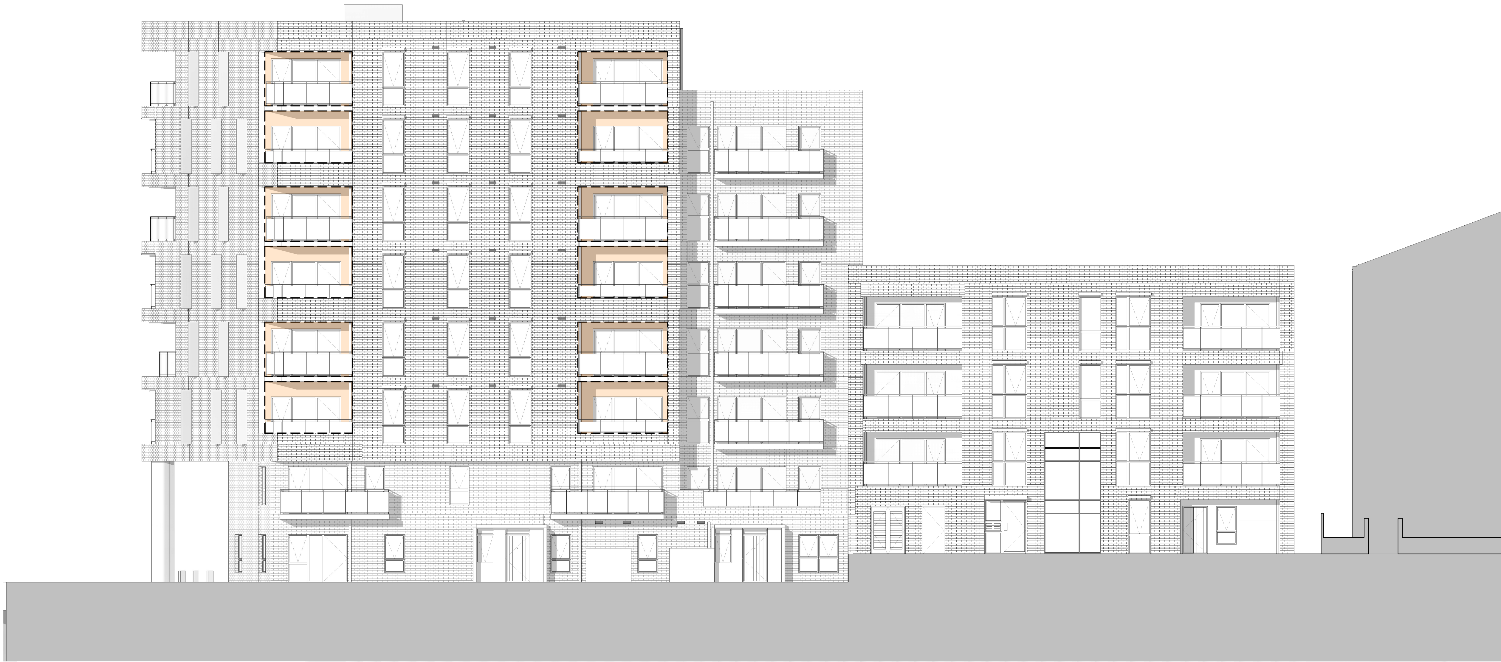
1 175 Elevation South - Proposed 1:100