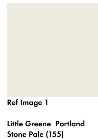
Ref Image 1 Little Greene Portland Stone Pale (155)