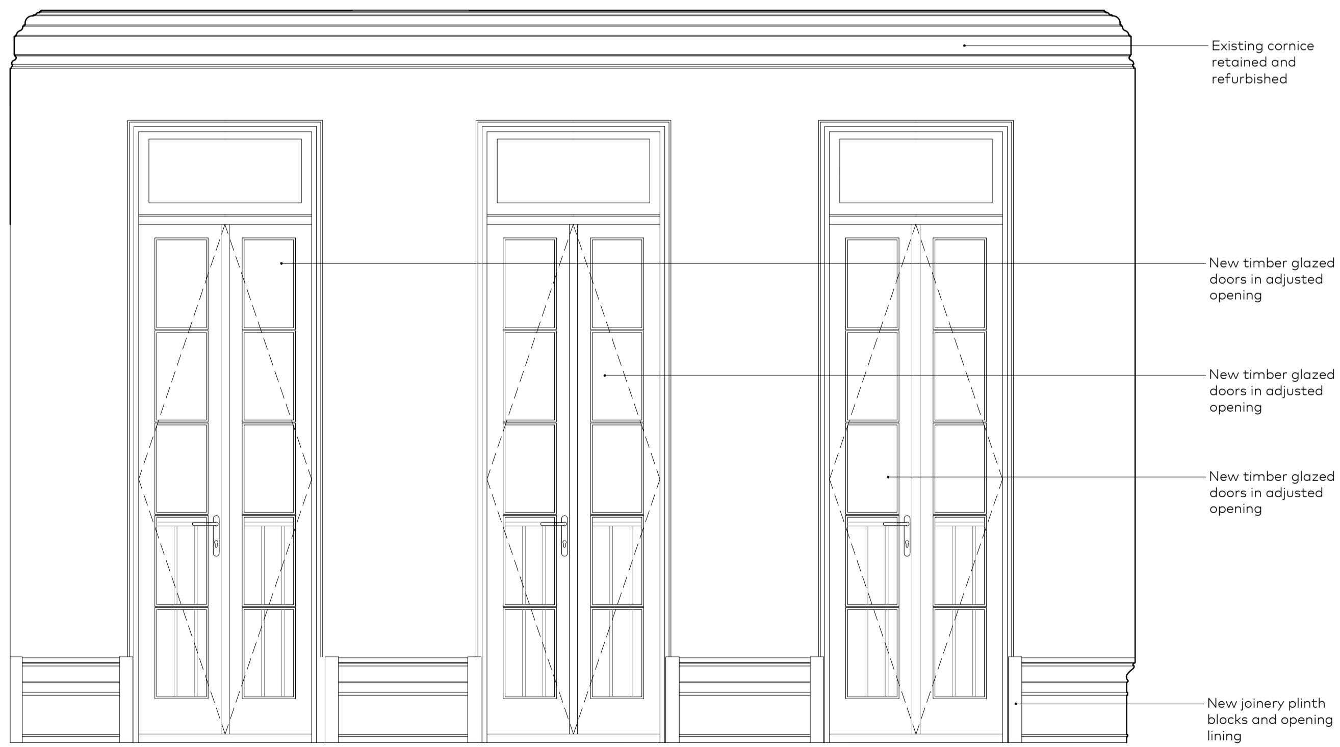
GF.11 2 Elevation 02 As Proposed 1:20