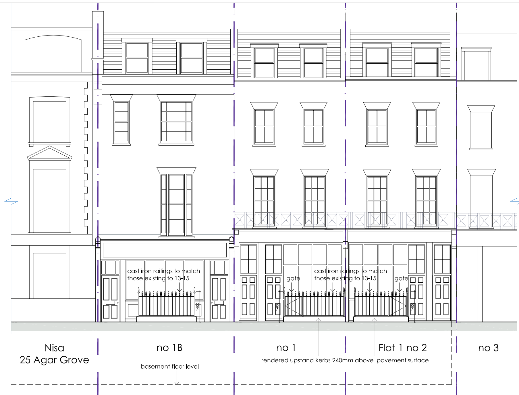
front elevation to Murray Street as proposed