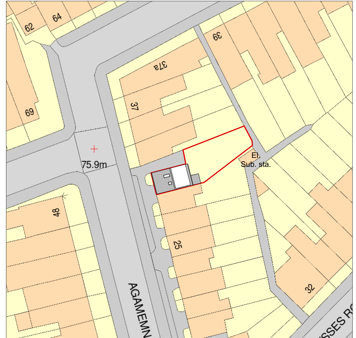
Site Block Plan 1:500