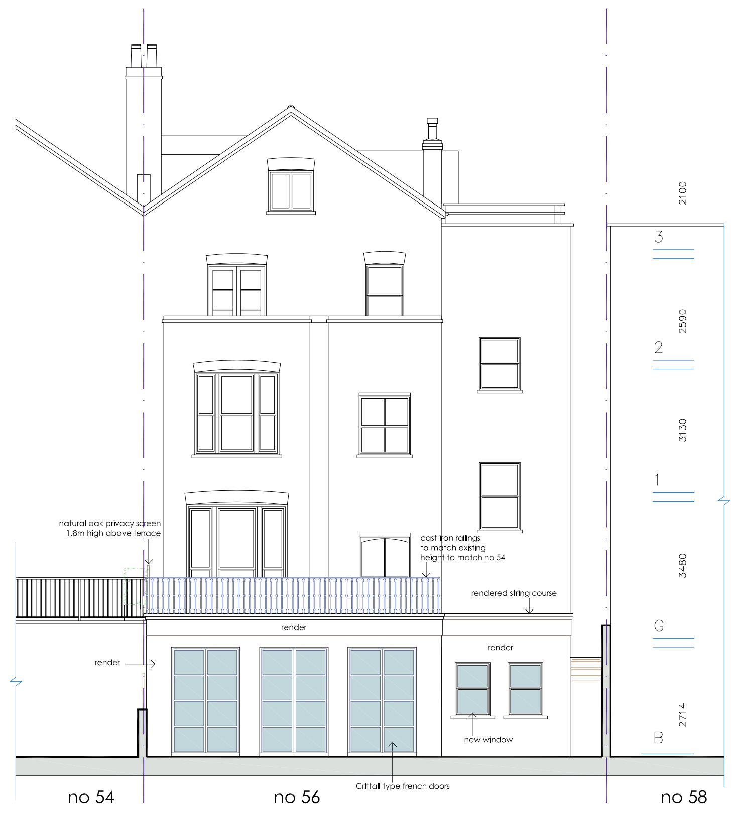
rear elevation as proposed