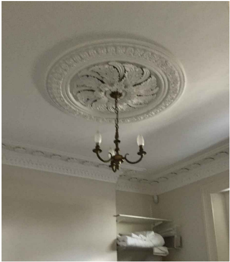
04 Bedroom 2 Ceiling as Existing 3005 NTS @ A3