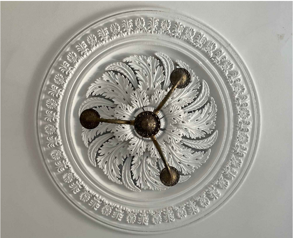
02 Photo As Existing Ceiling Rose - Bedroom 2 3005 NTS @ A3

New plaster ceiling rose to Bedroom 1 to match existing in Bedroom 2.