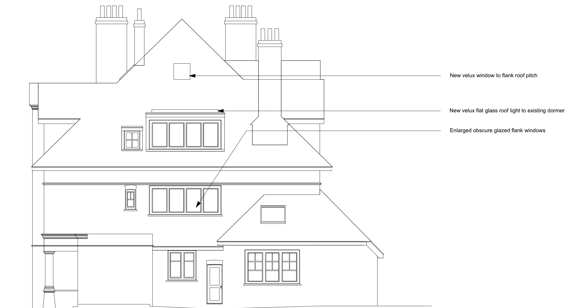
Proposed East elevation