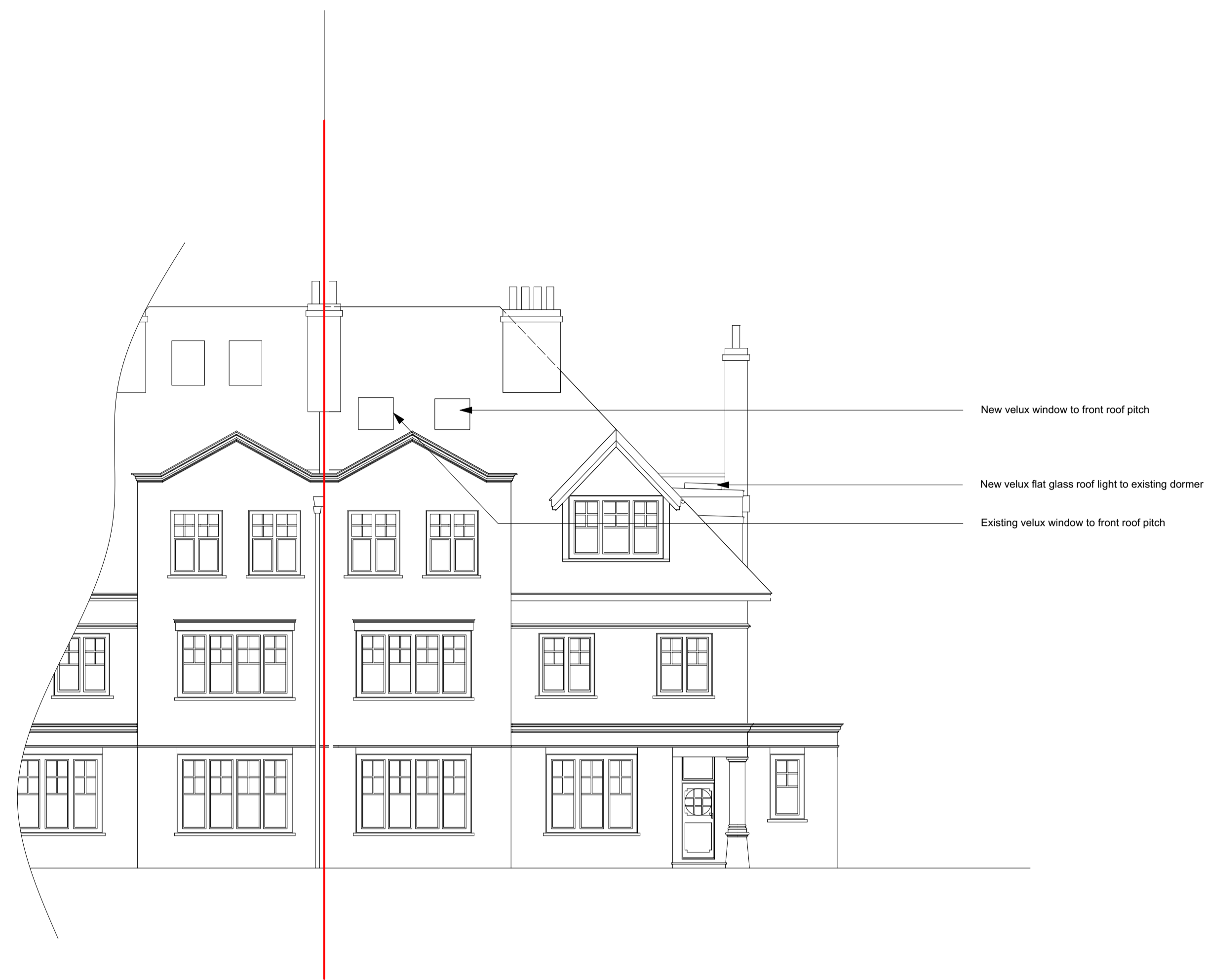
Proposed South elevation

In the event of any detail or dimensional conflict between Charlton Brown Architects drawings, the matter must be referred back to Charlton Brown Architects for clarification