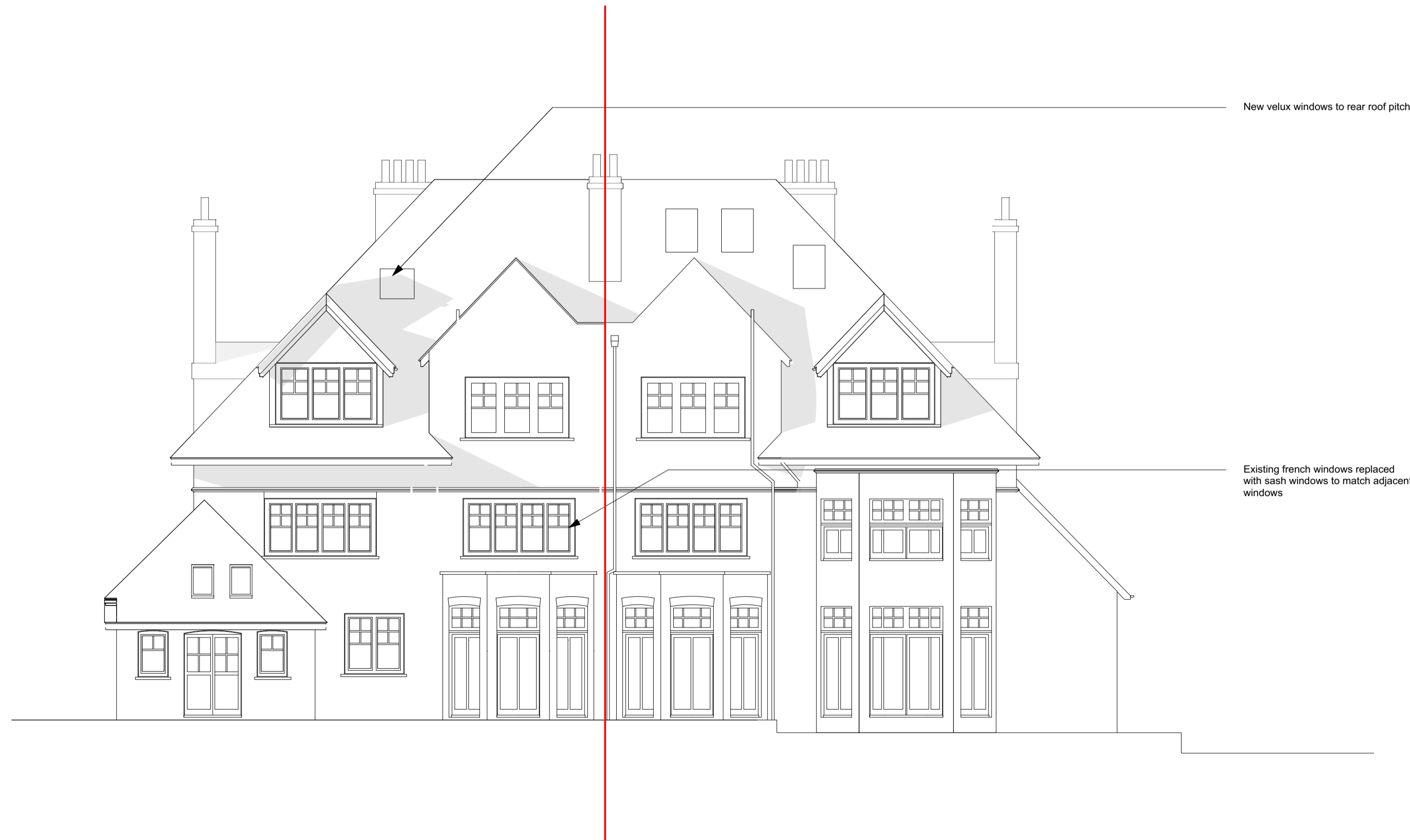
Proposed North elevation