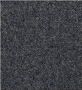
SF-02 Core Circulation Tea point/ ramps