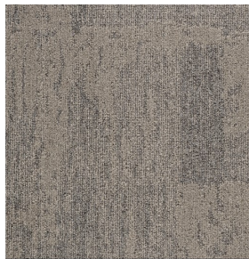
SF-08 Teaching rooms