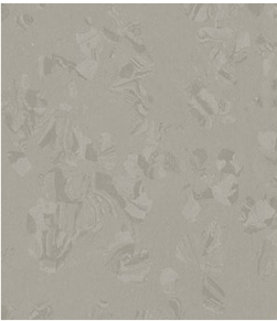
SF-06 Common room