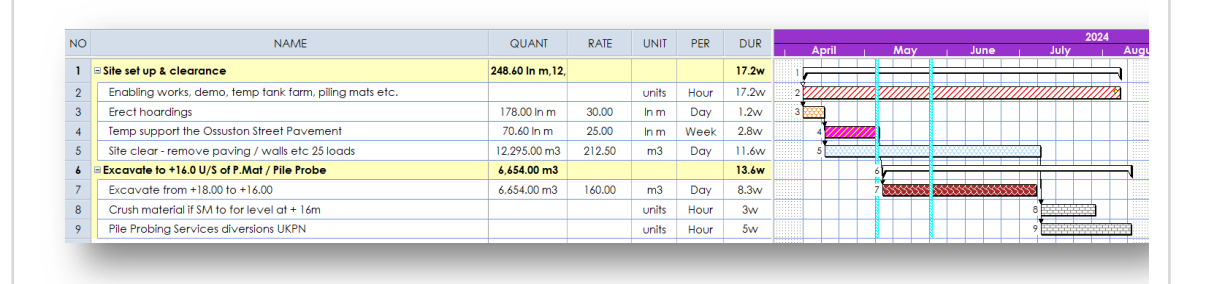
Figure 8 – Programme extract detailing enabling works

1. The enabling works contract is based upon the following activities, preceding the main contractor's access. If the timing can be improved, it would be better for these activities to be included within the main CR2 contract.