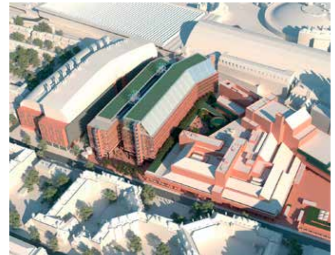
Revised design with linked linear buildings

The revised proposal presents a pair of linked linear buildings, separated by a glazed atrium that forms the roof and provides daylight to the new library foyer, illustrated below. The Proposed Development generally follows this form. However, to reduce impacts on residents along Ossulston Street, the western end of the building was shifted 18 metres to the east.