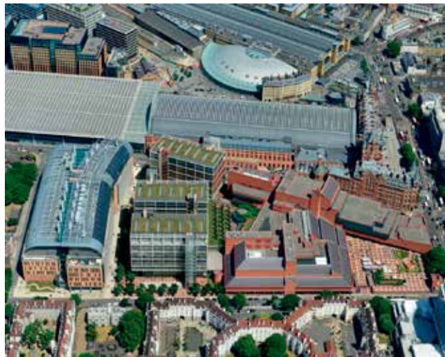
Earlier design with three distinct buildings

Subsequently, a design was developed that included three distinct buildings, as shown below.