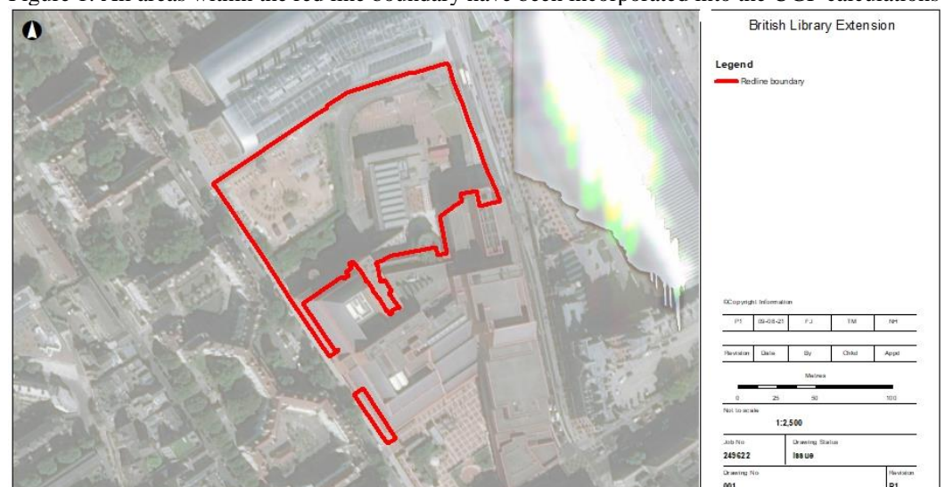
Figure 1: All areas within the red line boundary have been incorporated into the UGF calculations

The pre-development UGF has been calculated for the site (shown in Figure 1). Taking into consideration the existing urban allotment<sup>2</sup>, amenity grassland, introduced shrub and scattered trees recorded on site in the Preliminary Ecological Appraisal (PEA)<sup>3</sup> (areas), there is a pre-development score of 0.24 for the site.