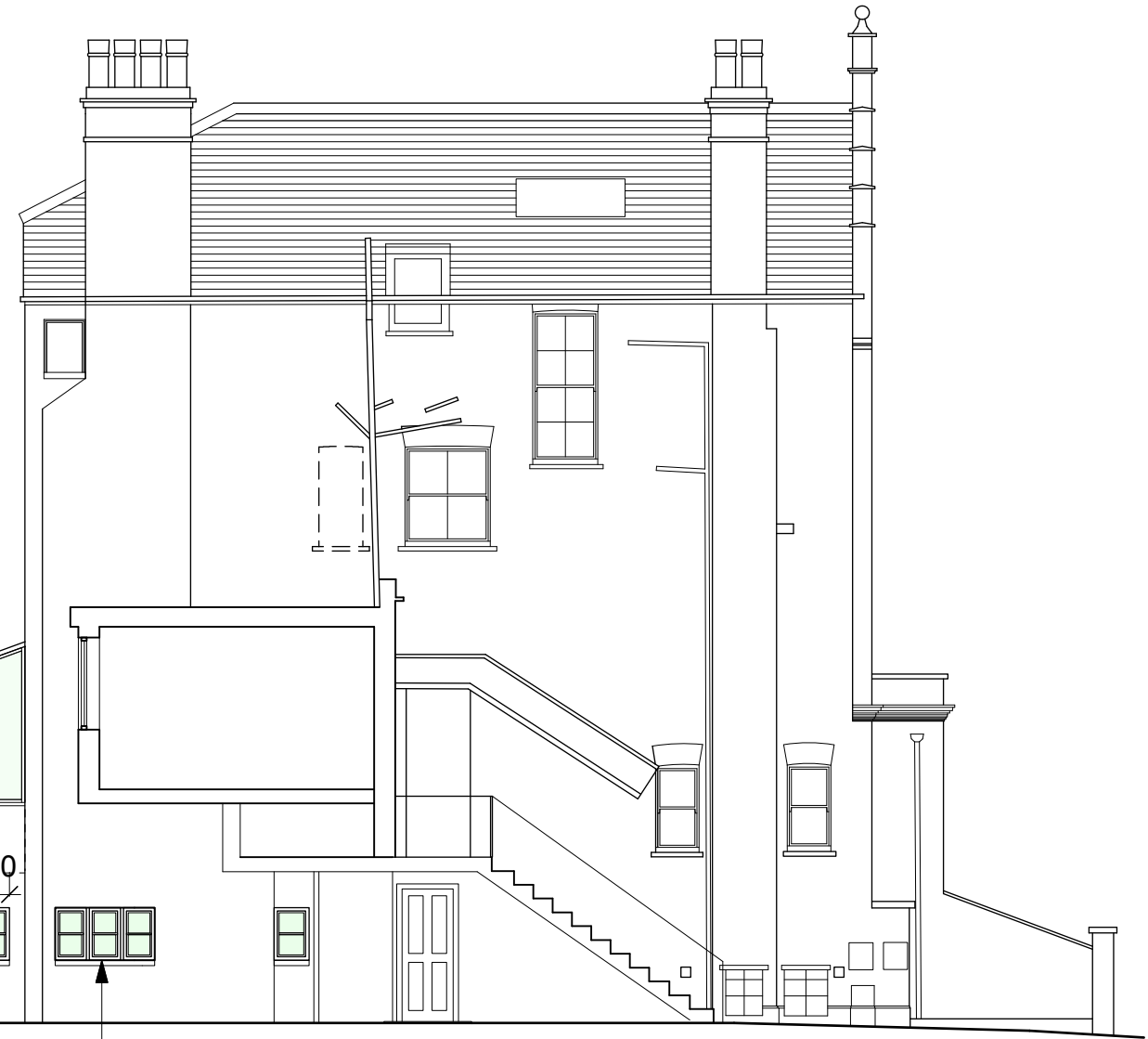
new timber sash windows