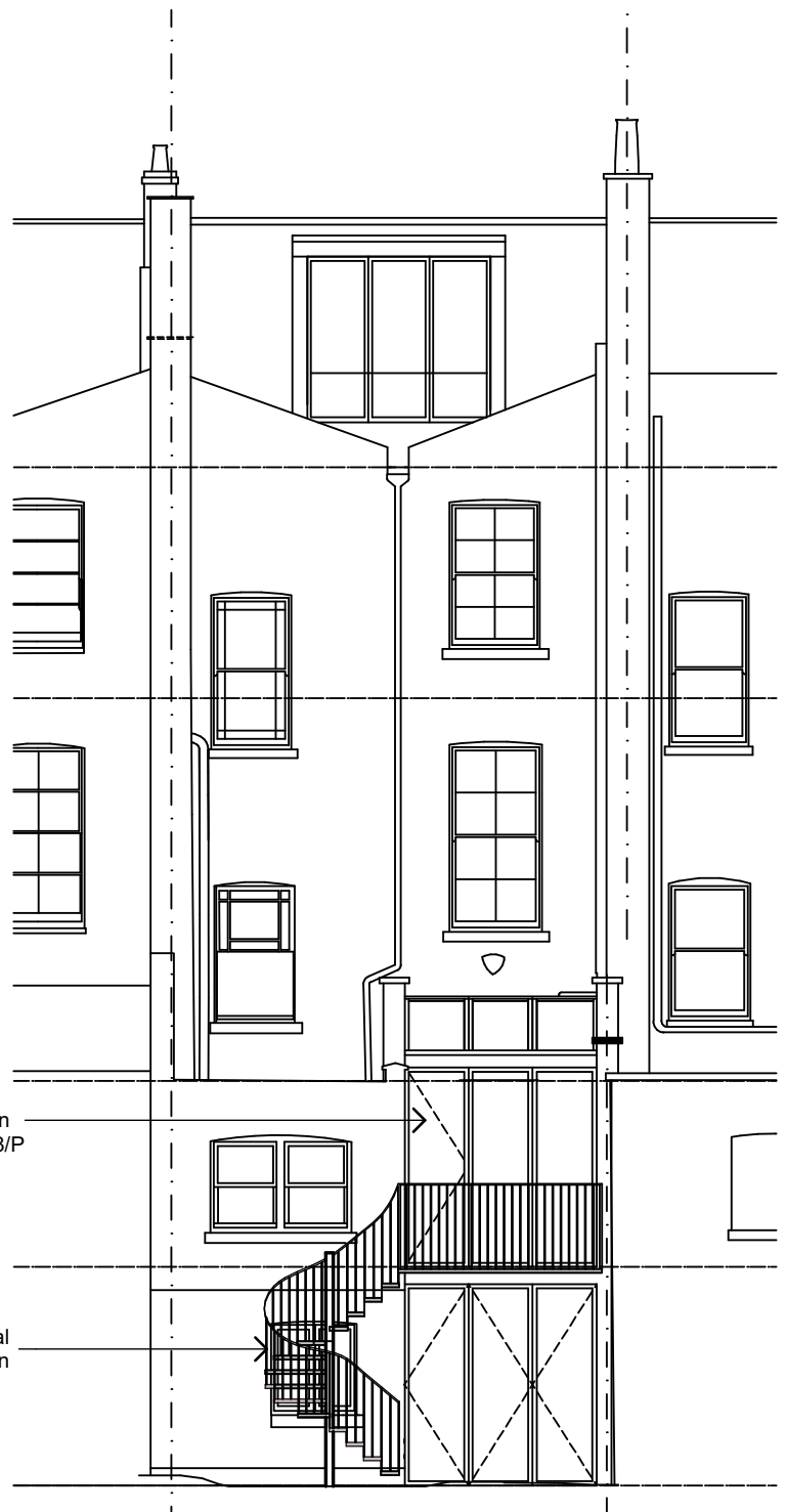
4 PROPOSED - REAR ELEVATION 1:100

Proposed balcony and spiral stair access to rear garden