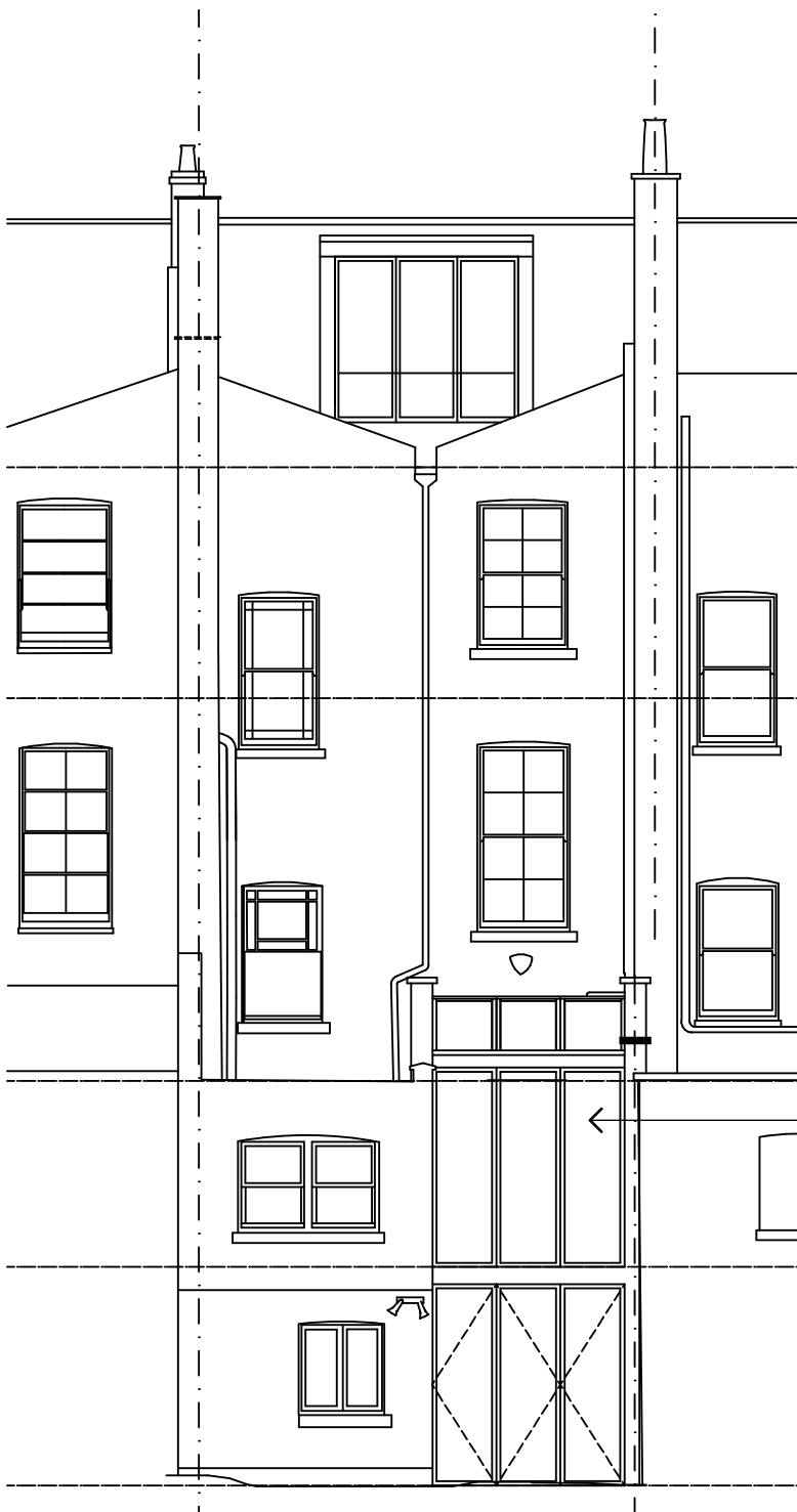
1 EXISTING - REAR ELEVATION 1:100

Rear infill glazed extension granted planning permission 03.11.2014 Ref: 2014/5248/P