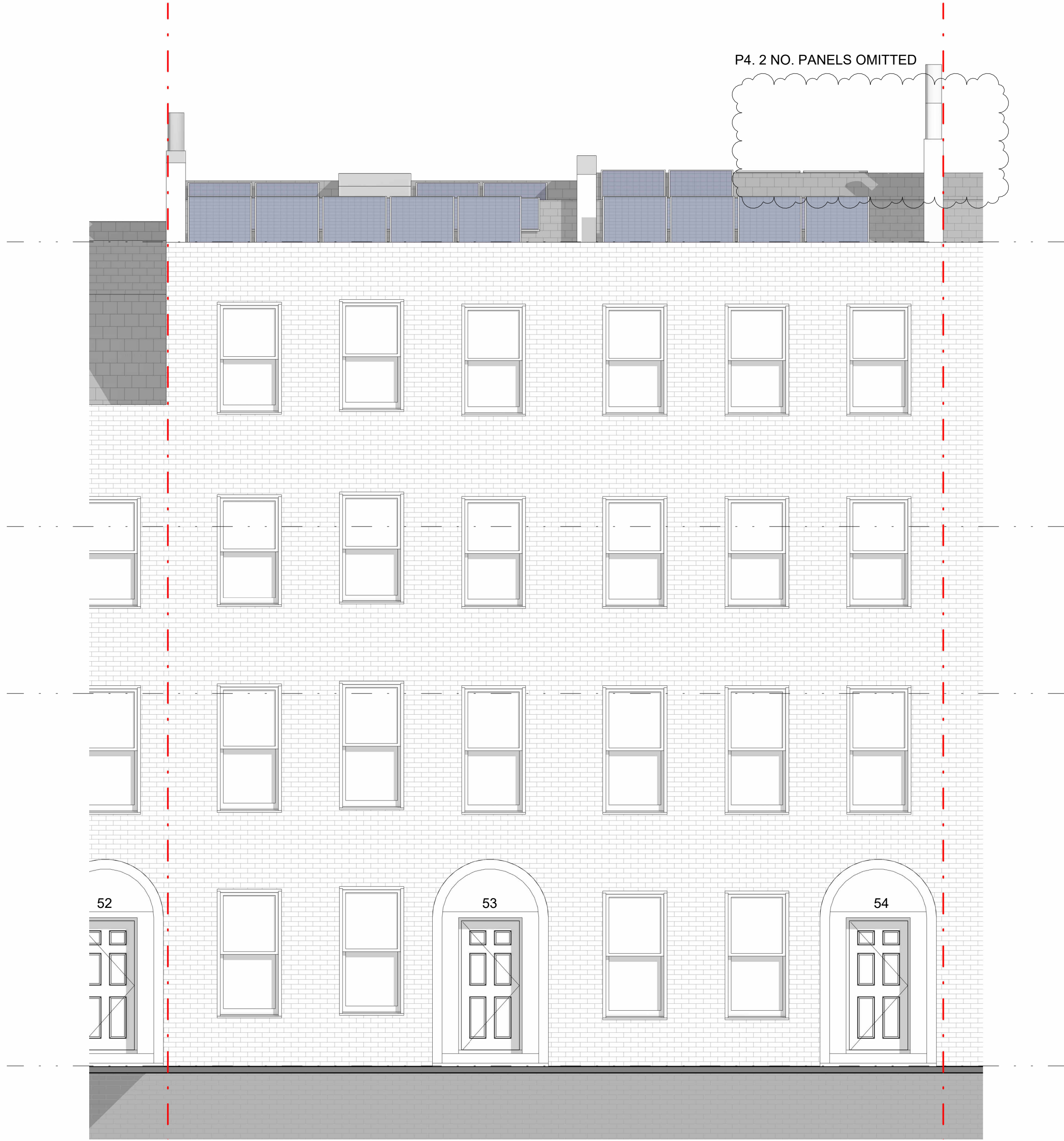
1 Nos. 53 & 54 South West Elevation - Proposed 1 : 50