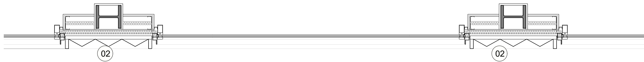
03 Proposed Plan 1:25