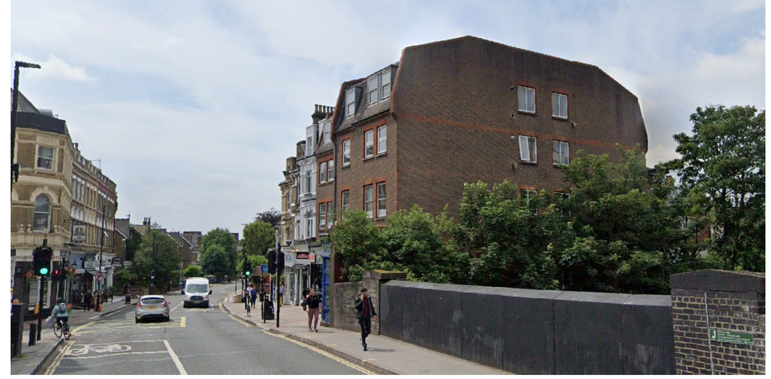
1 - Facing South along West End Lane. Flank of 79-181 shown on right hand side of image.

179-181 West End Lane Photographic Report Feb 2022