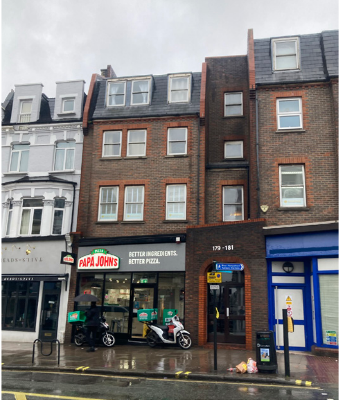
1 - Remaining front facade of 179-181 West End Lane