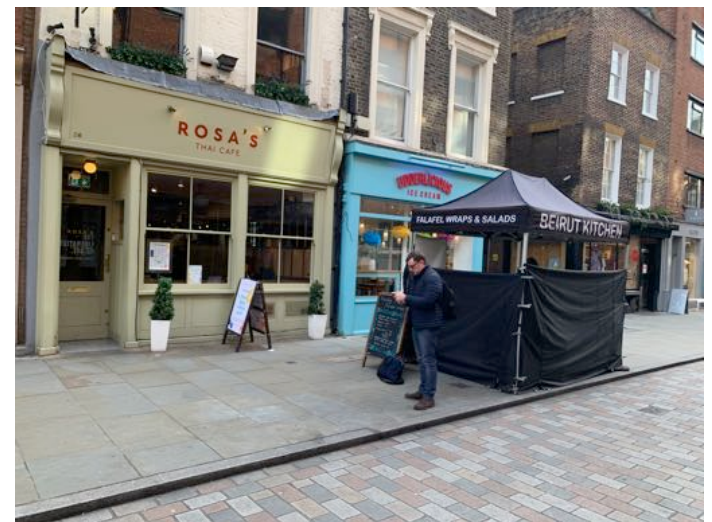
2 Photos of the site / pavement.