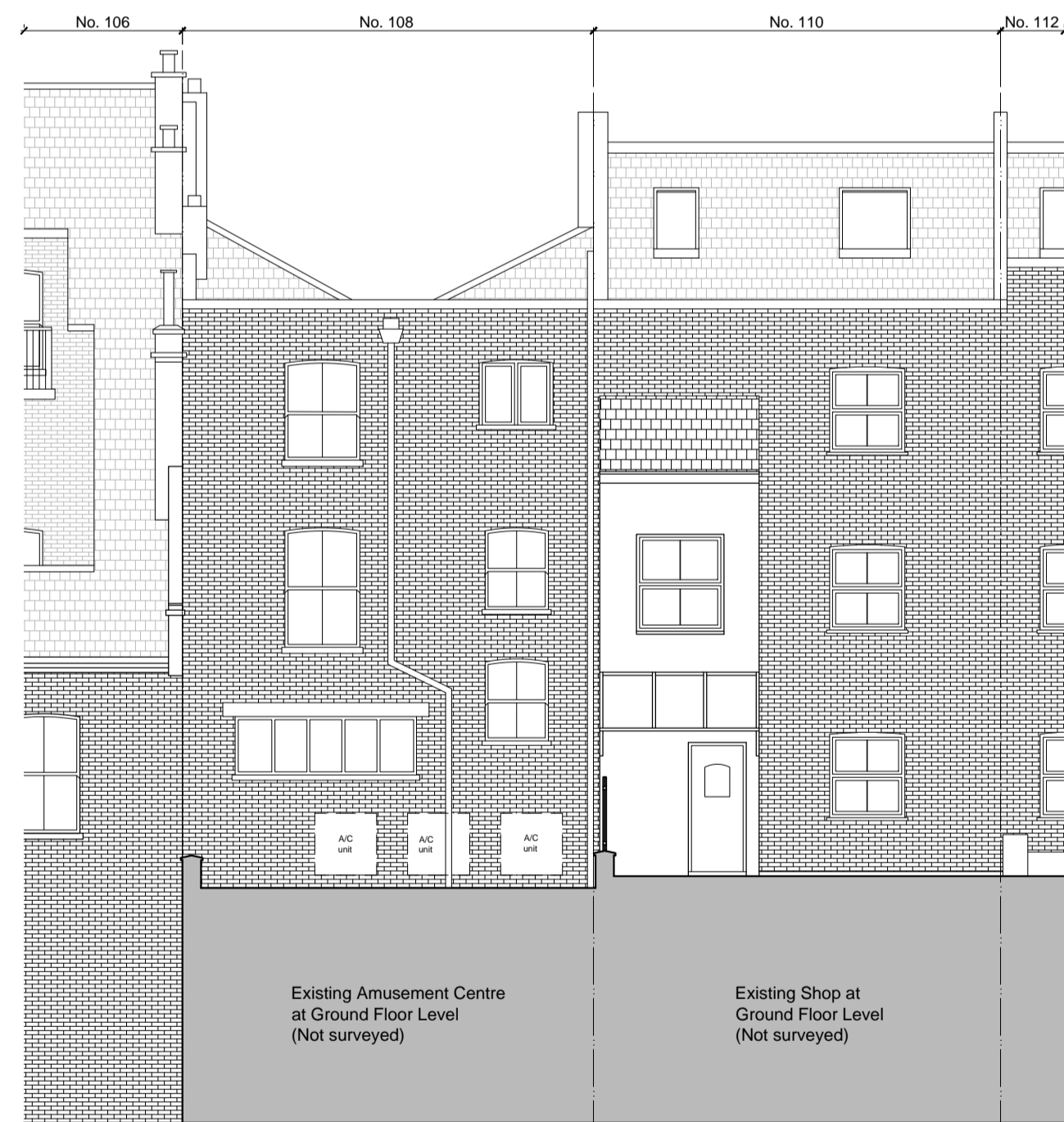
Existing Rear (North-East) Elevation Scale 1:100