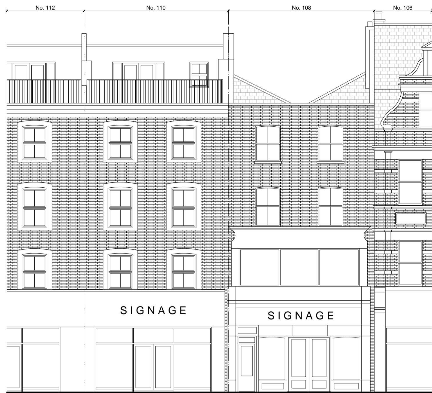
Existing Front (South-West) Elevation Scale 1:100 Metres 1:100