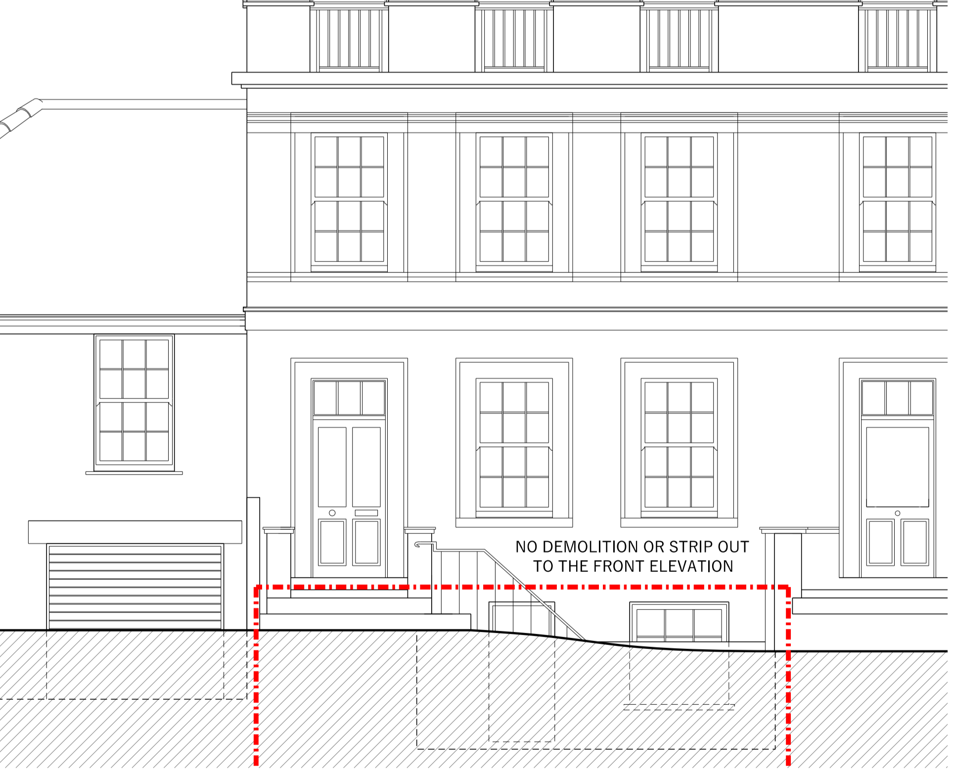
Proposed Front Elevation - Demolition Drawing