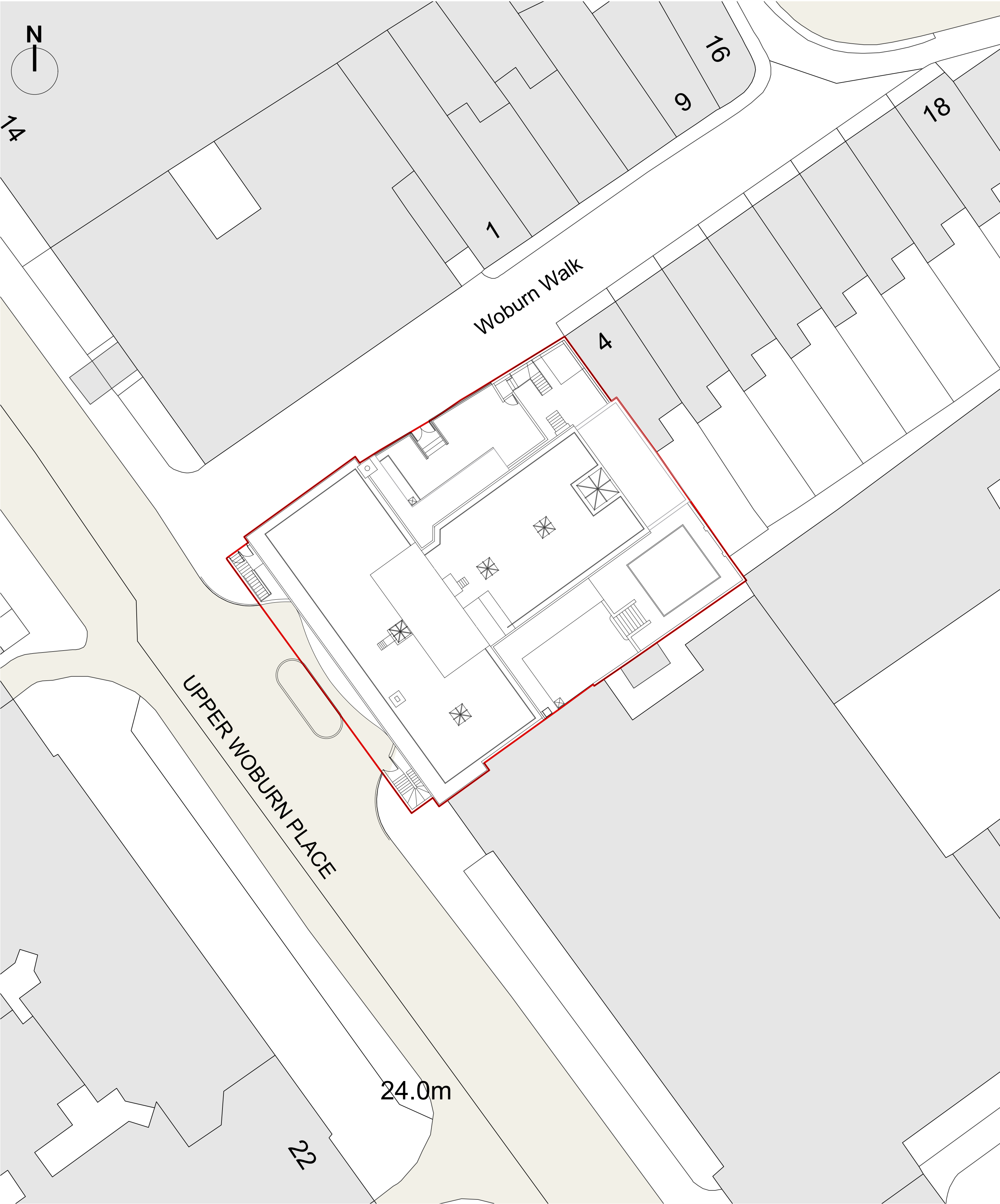
SITE PLAN SCALE: 1:200