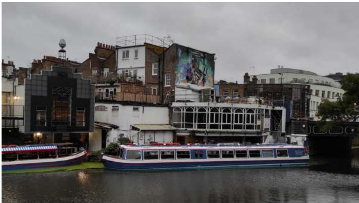
Figure 2: View of rear of properties on Camden High Street, separation distance >45m