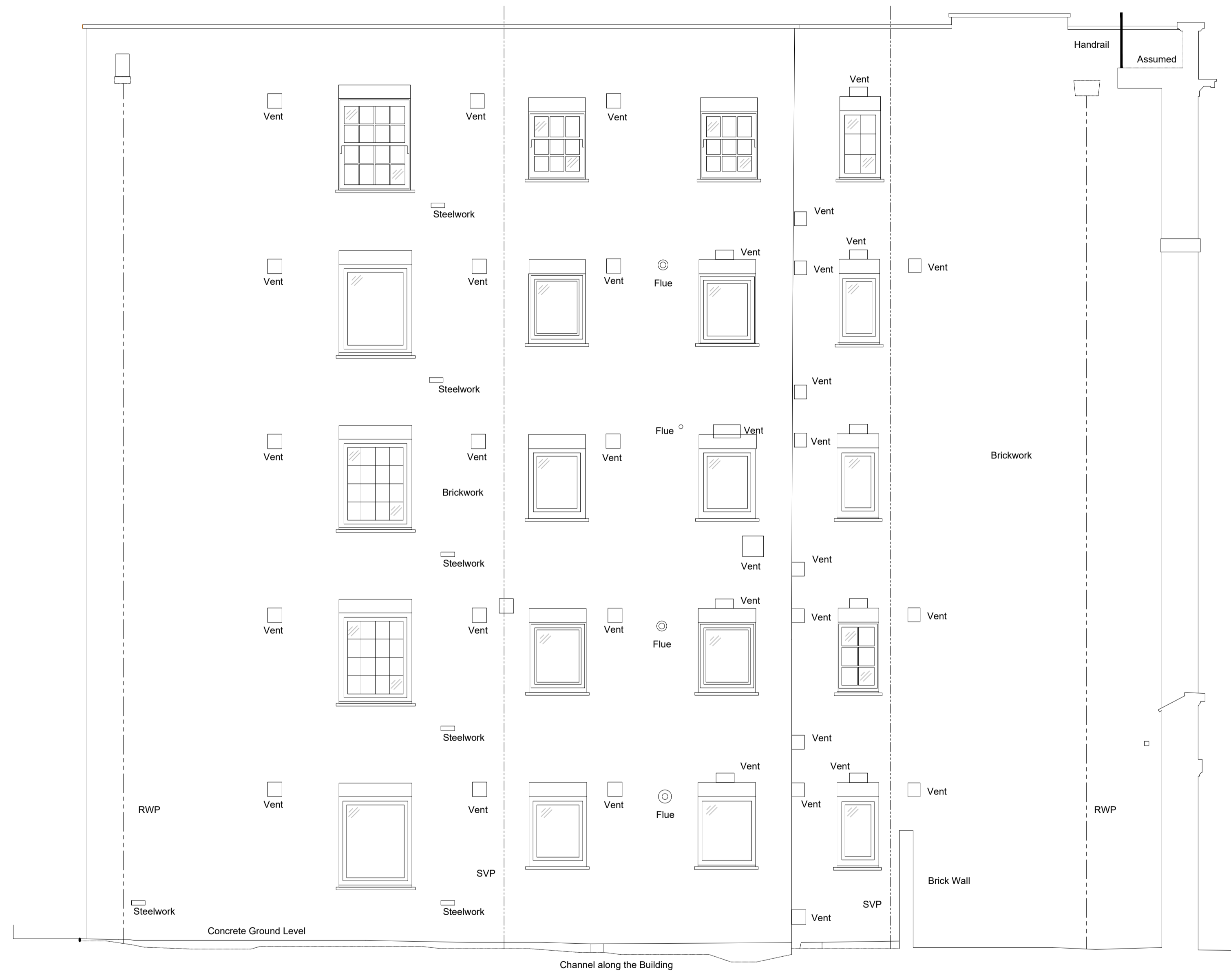
South West Facing Elevation Elevation 1