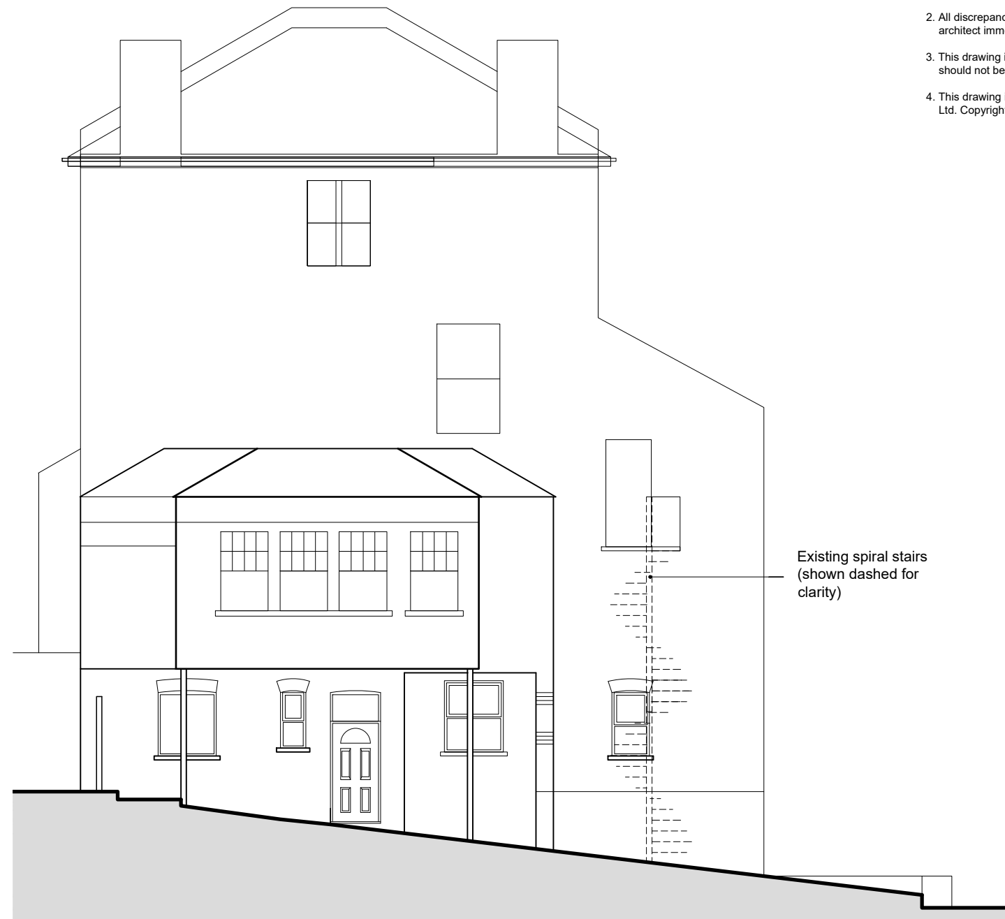
EXISTING NORTH (SIDE) ELEVATION