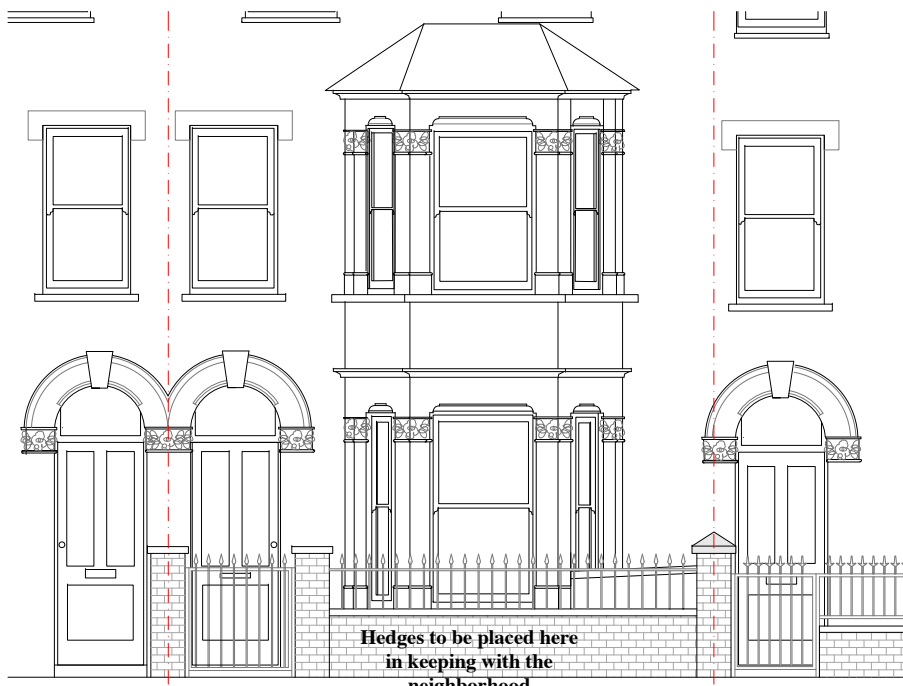
1 Front Elevation P01b SCALE 1:50