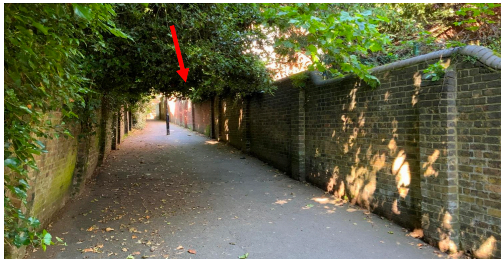
Image 1.02 - Wall as seen from Spring Wall side