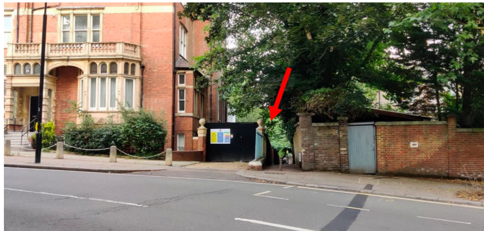
Image 1.01 - Metal fence and stone details to be carefully removed and reinstated at the end of the construction period