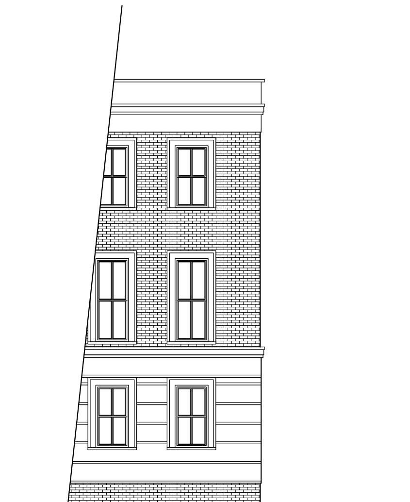
Part-Flank Elevation as Existing