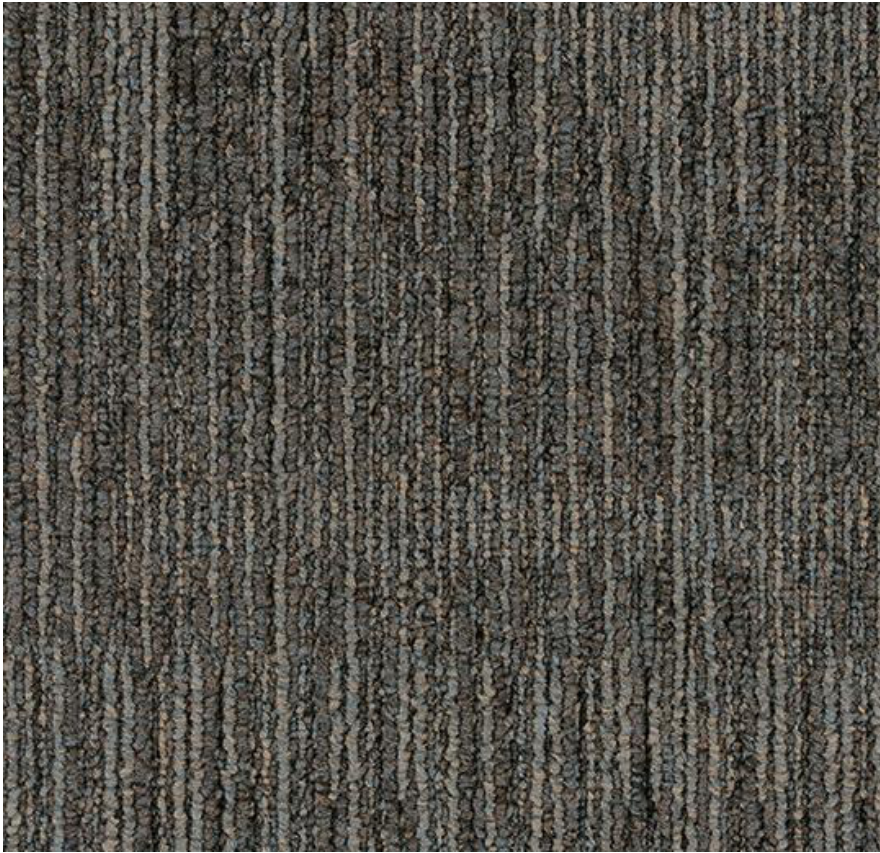
FORBO TESS INLINE ONYX STAIRCASES