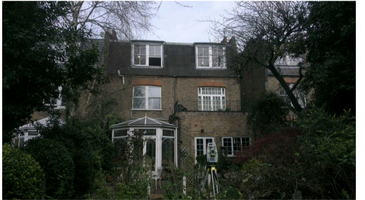
3 PHOTOGRAPH OF REAR ELEVATION

Notes All setting out of work to be checked before work commences. Any errors to be reported to the Architect before any further work is carried out. All work to be in accordance with the relevant Building Regulations.