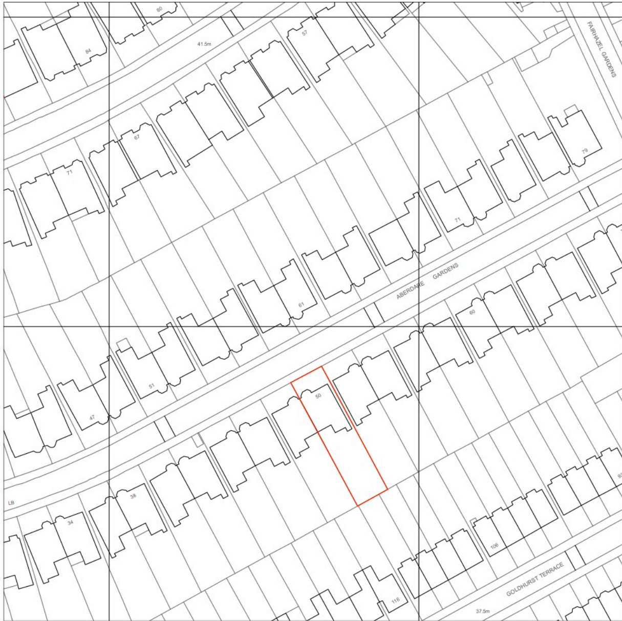
1 LOCATION PLAN Scale 1:1250