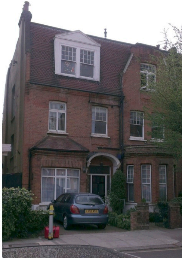
2 PHOTOGRAPH OF FRONT ELEVATION