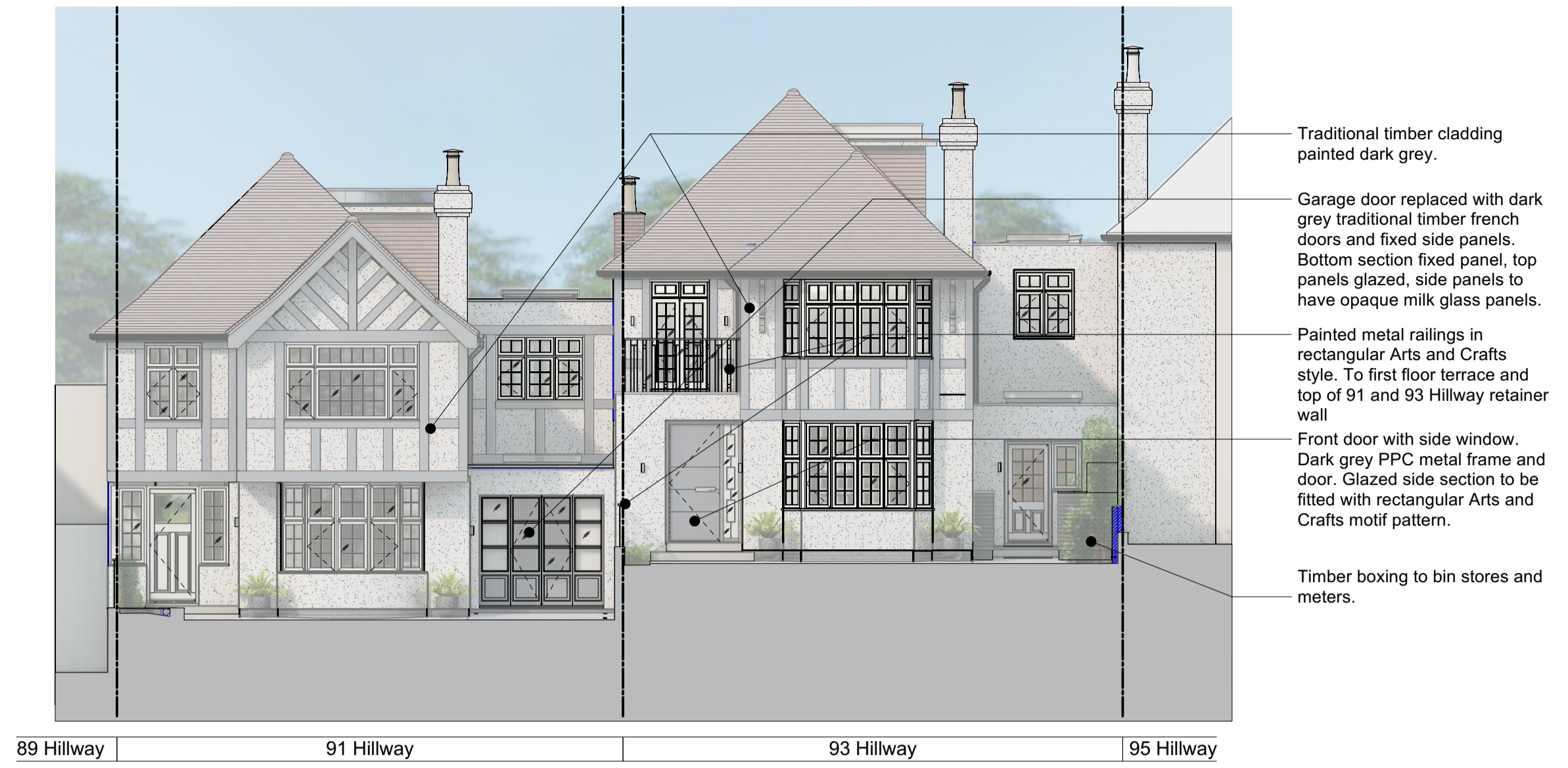
4 House Front Elevation Scale: 1:100