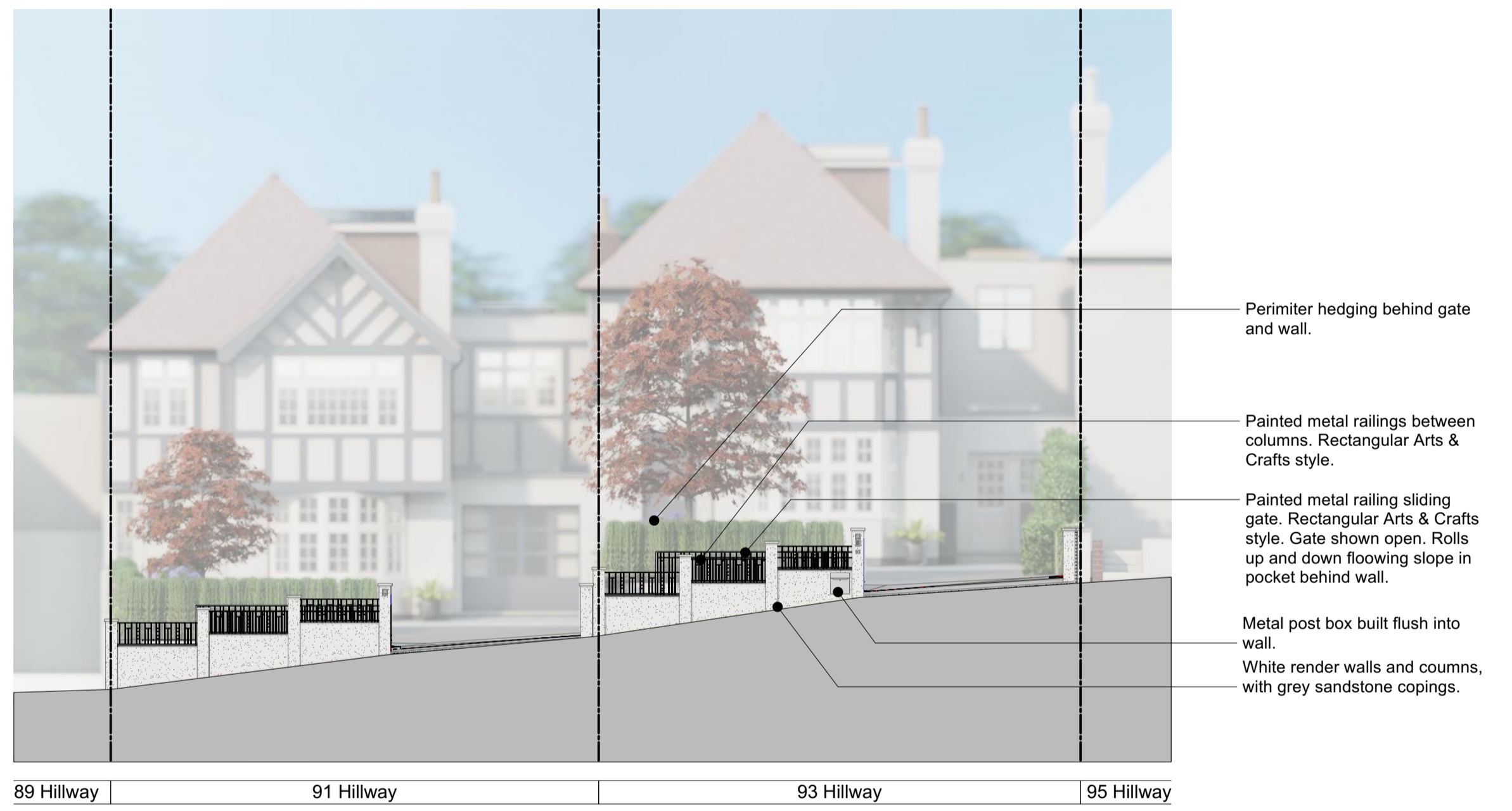
2 Street elevation Scale: 1:100