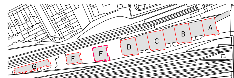
West Hampstead Square - Key Plan