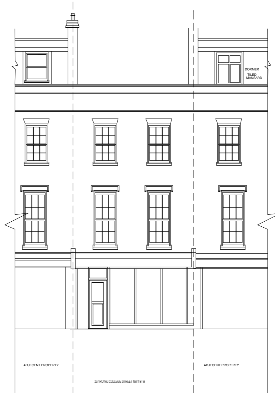
FRONT ELEVATION AS EXISTING