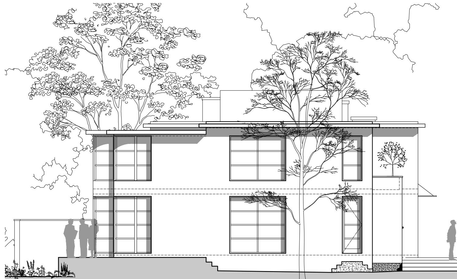
PROPOSED SIDE ELEVATION D-D SCALE 1:100 @ A3