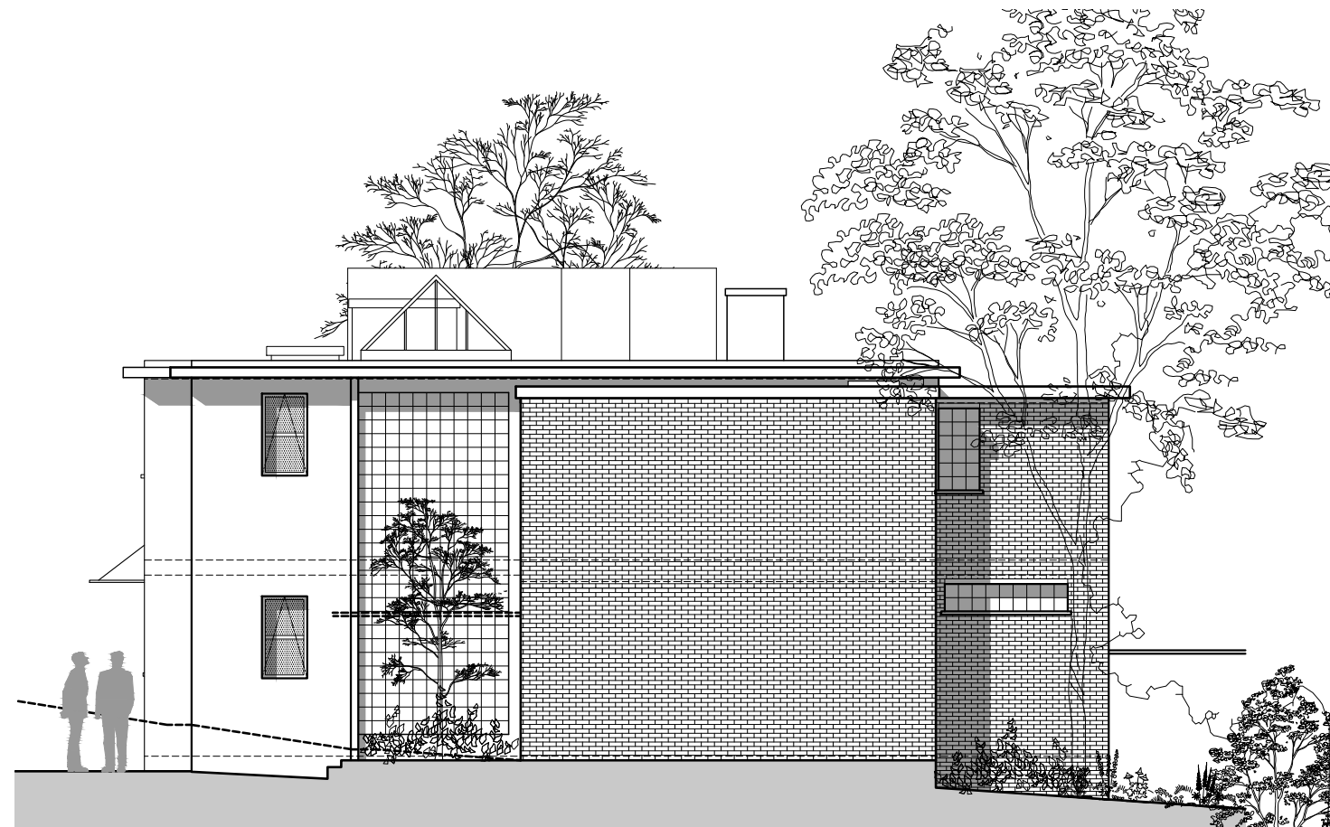
PROPOSED SIDE ELEVATION B-B SCALE 1:100 @ A3