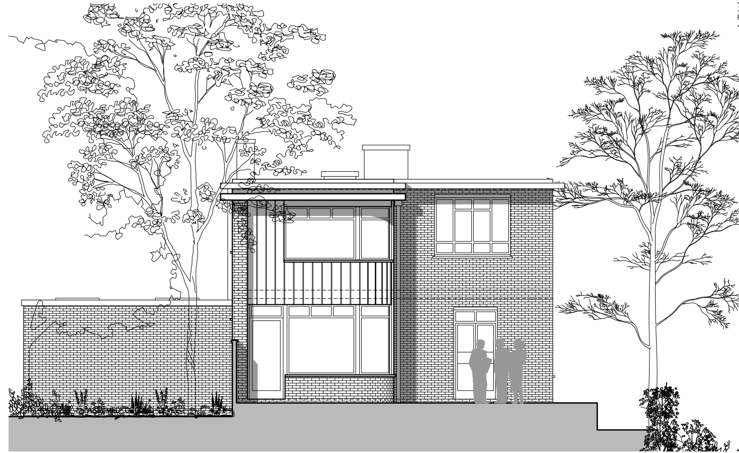
EXISTING REAR ELEVATION C-C SCALE 1:100 @ A3