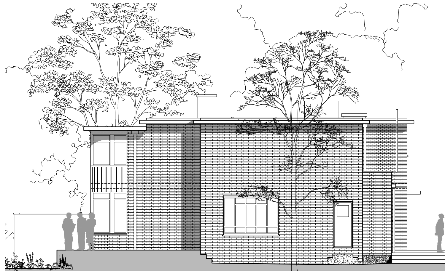
EXISTING SIDE ELEVATION D-D SCALE 1:100 @ A3