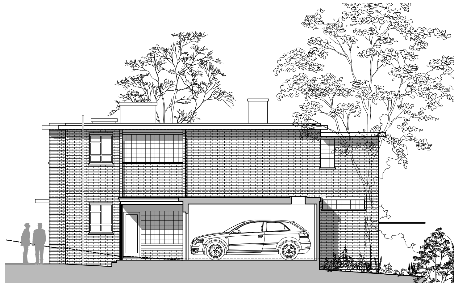
EXISTING SIDE ELEVATION B-B SCALE 1:100 @ A3