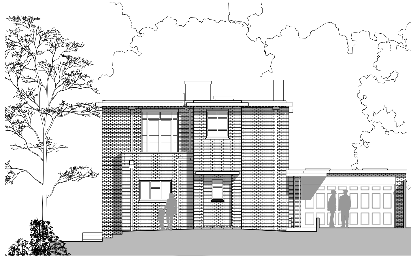
EXISTING FRONT ELEVATION A-A SCALE 1:100 @ A3